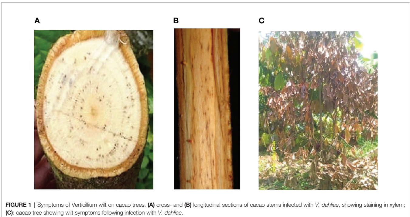
FIGURE 1 | Symptoms of Verticillium wilt on cacao trees. (A) cross- and (B) longitudinal sections of cacao stems infected with V. dahliae , showing staining in xylem; (C) : cacao tree showing wilt symptoms following infection with V. dahliae .

apricot ( P. armeniaca L.) (Taylor and Flentje, 1968; Vigouroux and Castelain, 1969), avocado ( Persea americana Mill.) (Latorre and Allende, 1983), olive (Blanco-López et al., 1990), pistachio ( Pistacia vera L.) (Hiemstra, 1998) and ash tree ( Fraxinus excelsior L.) (Keykhasaber et al., 2018). For a given species, recovery may depend on the genotype. In cacao, recovery is rarely observed (Matovu, 1973) and only in more resistant varieties (Resende, 1994). For olive, it has been observed that the recovery of resistant and moderately resistant genotypes was three times more likely to occur than the recovery of susceptible plants (López-Escudero and Blanco-López, 2005). More details on the biology of Verticillium wilt in cacao are presented in Flood et al. (2016).