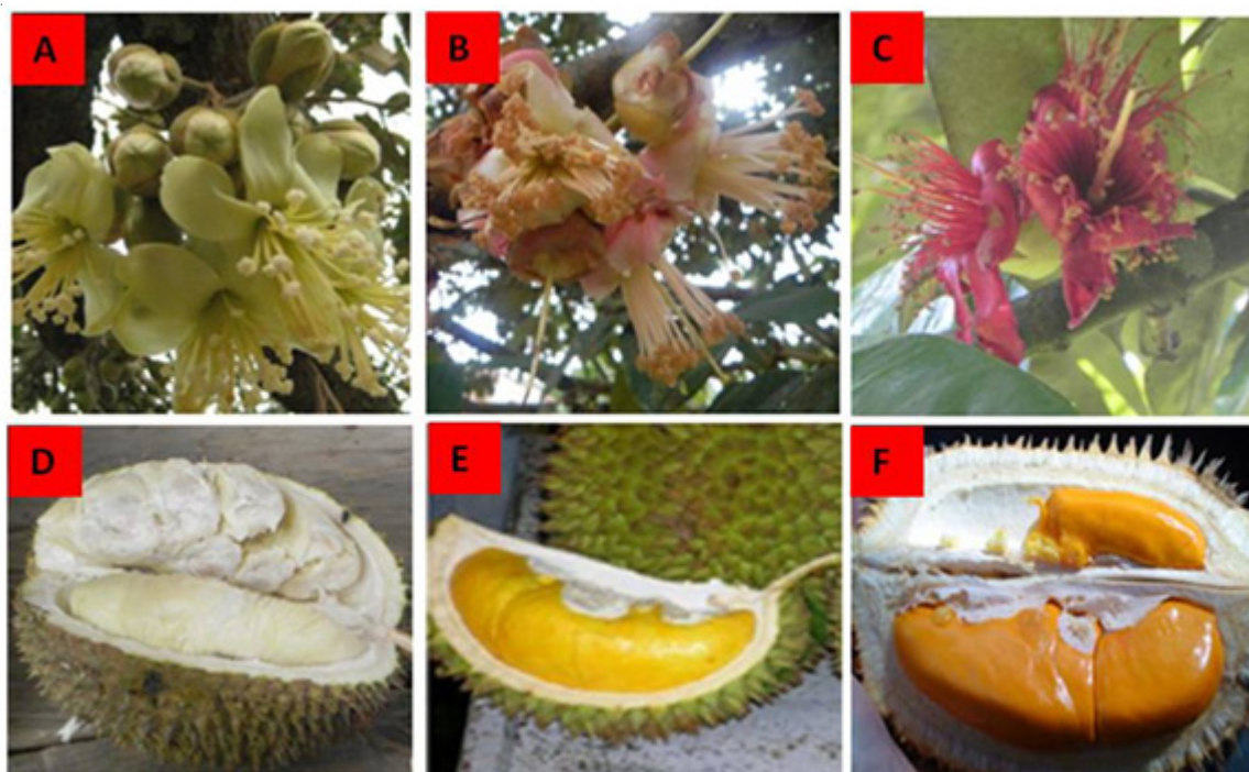
Fig. 2 Flower and fruit aril of Durio from East Kalimantan. A, D: D. zibethinus , B, E: Lai Durian , and C, F: D. kutejensis .

Durian (Table 2). This is consistent with the previous result that D. zibethinus had higher sugar content. During fruit ripening process, carbohydrates and other organic compounds will be degraded, in glycolysis metabolism, into simple compounds like sugars as a major product (Ahmed and Labavitch, 1980; Carrari and Fernie, 2006; Martinelli et al. , 2012). The higher the carbohydrate and lipid content the higher the sugar content will be produced. The content of carbohydrates and lipid of Lai Durian was higher than that of D. kutejensis , therefore Lai Durian was sweeter than the D. kutejensis .