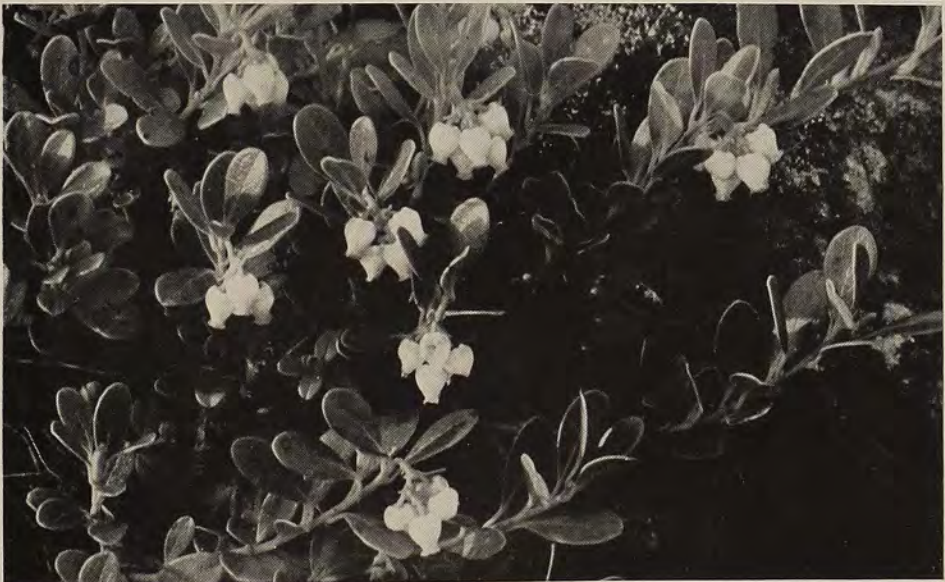
Ada White Sharples

Fritillaria camschatcensis (one-half natural size)