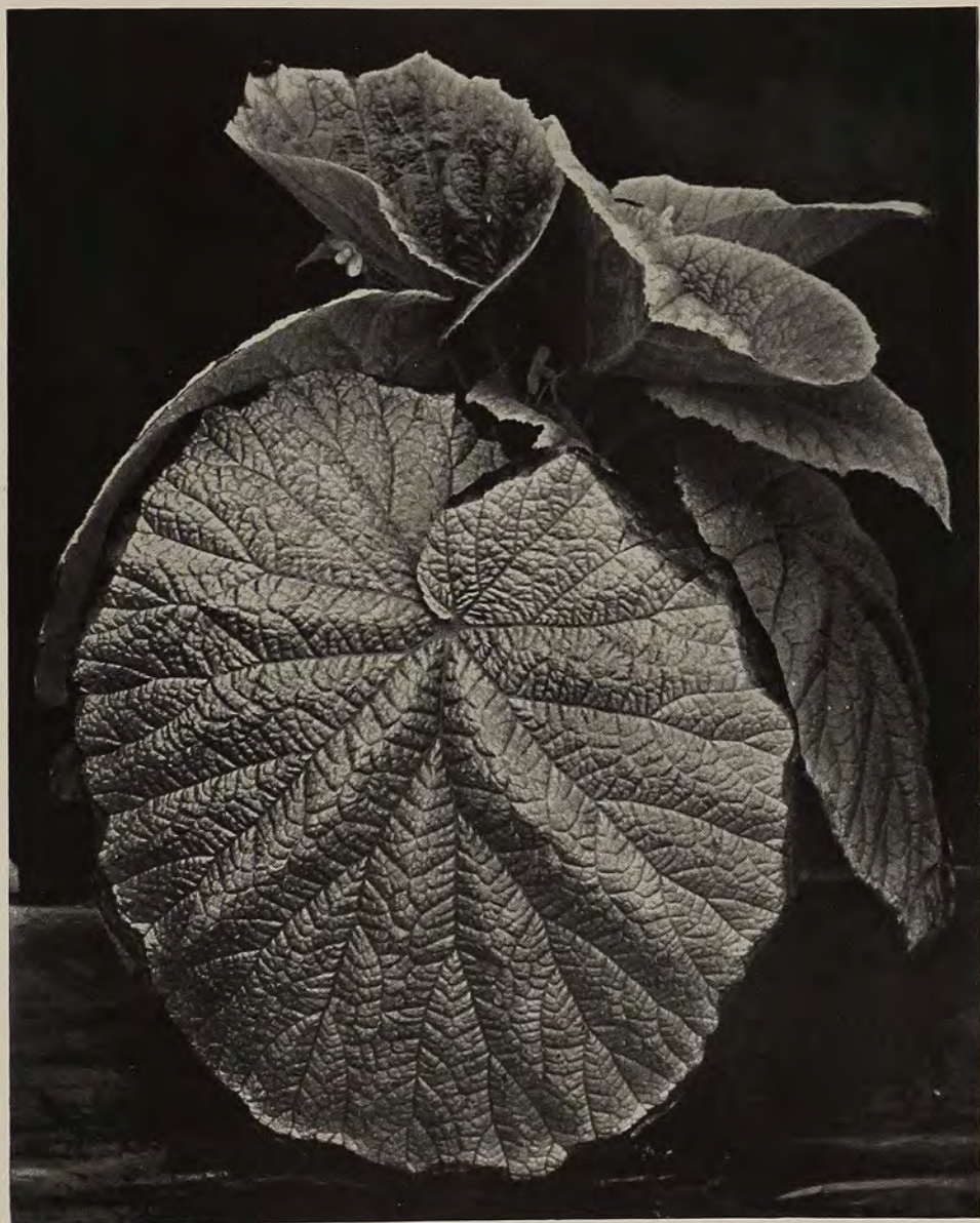
An unidentified Bhotan species Tuberous rooted; specimen in 6-inch pot; flowers scented.