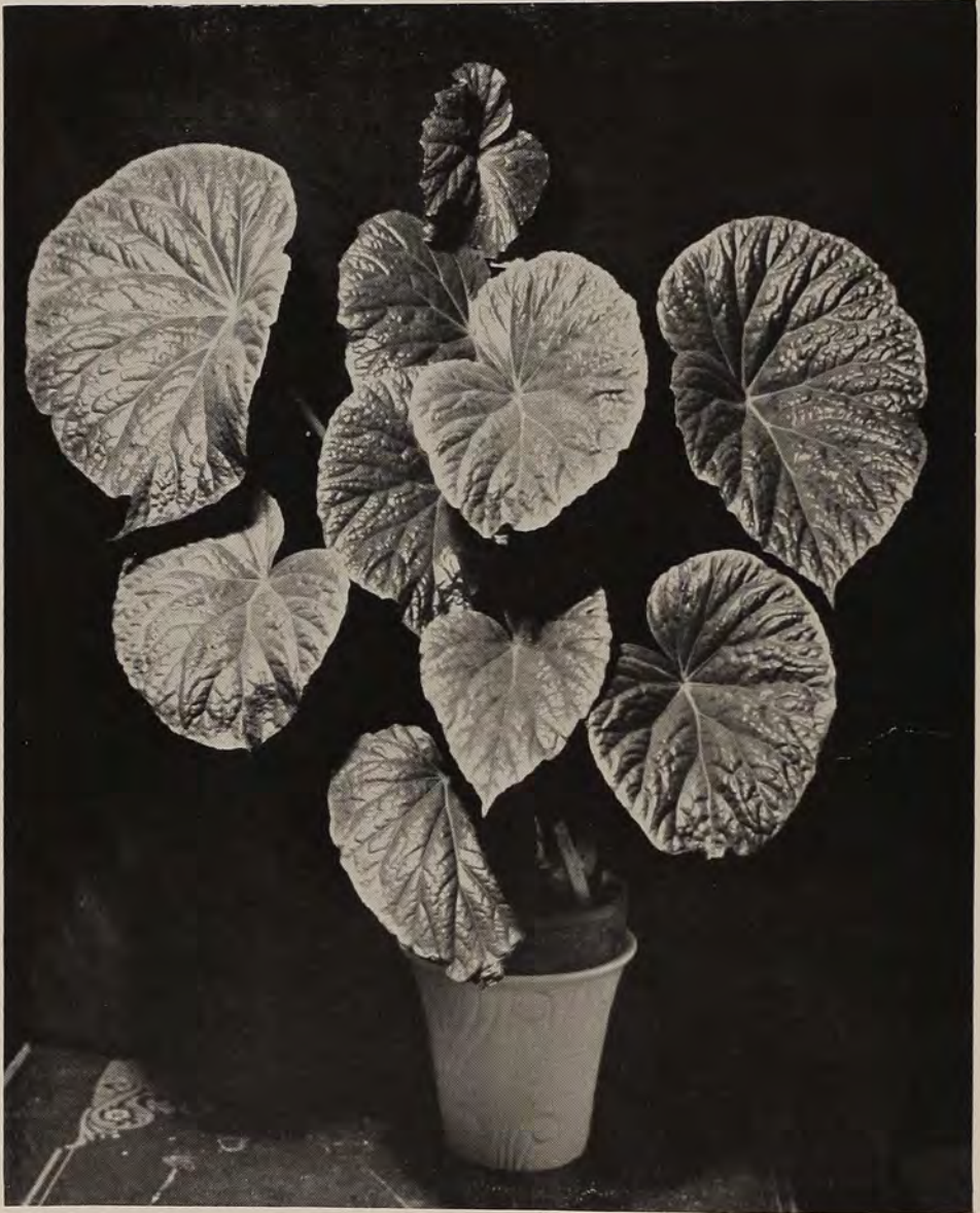
Begonia Roxburghii Specimen in a 6-inch pot.

manures are all beneficial in this respect.