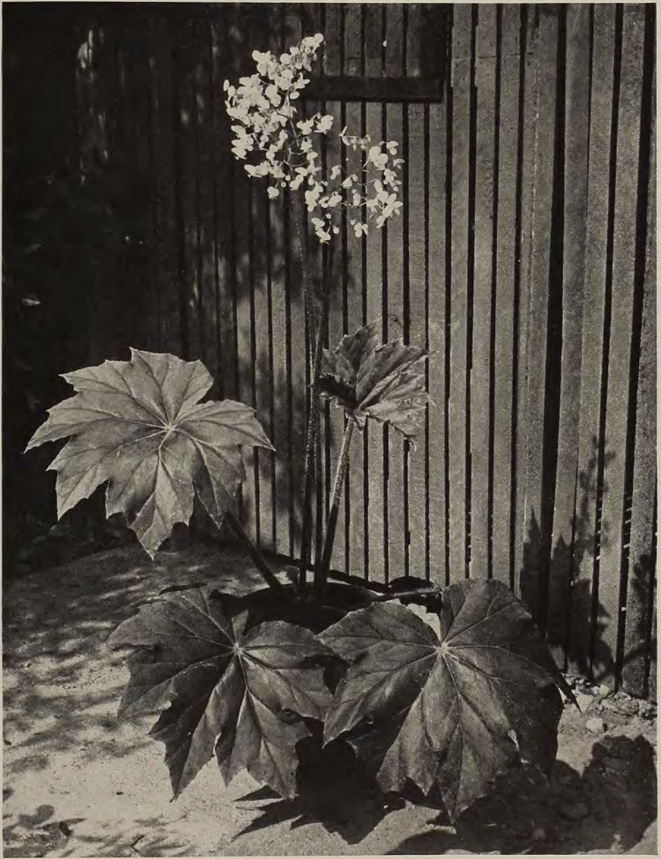
Begonia riciniifolia Specimen in a 10-inch pot.