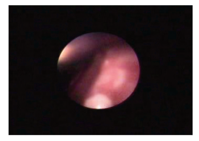
Figure 3. Mucosal erythema, granularity and edema of colon seen by the enteroendoscopy.