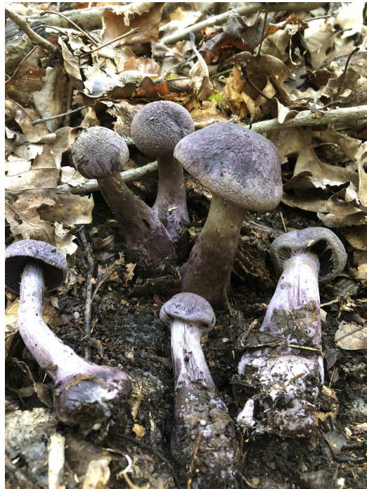
Cortinarius violaceus with it's distinctive cap texture and rich color

Other groups may include Holoxanthae, Leprocybe, and Malicoriae - but these groups are currently in a state of flux as genetic lineage is sorted.