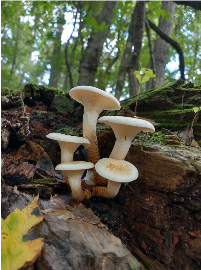
Neolentinis lepideus