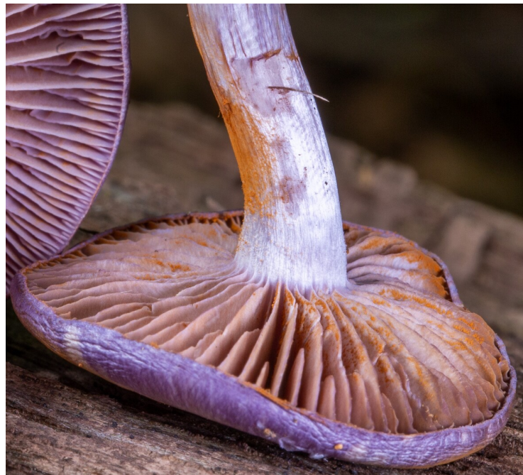
Here you can clearly see the spore drop on the gills and stipe

Finally, adnexed or enmarginate gill attachment (or close enough) is common across Cortinarius .