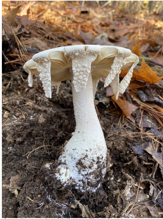
Amanita sect Lepidella smelling of gym socks