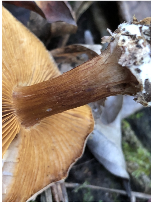
Notice the fibrous stipe and abrupt basal bulb