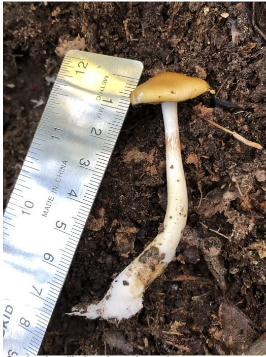
Cortinarius , likely subg. telamonia