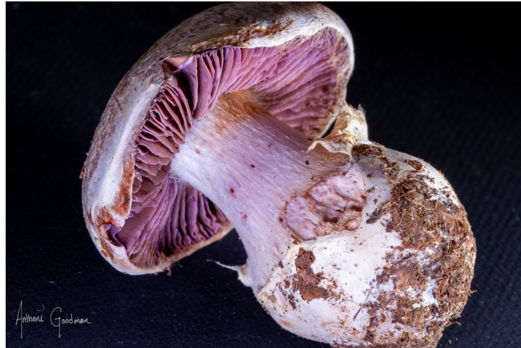
Purple gilled Cortinarius note the peronate universal veil on the bulb

Cortinarius is a massive genus of mushrooms, in fact it is the largest genera in regards to numbers of species.