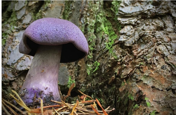
Cortinarius violaceus

Email almushroomsoc@gmail.com for more information.