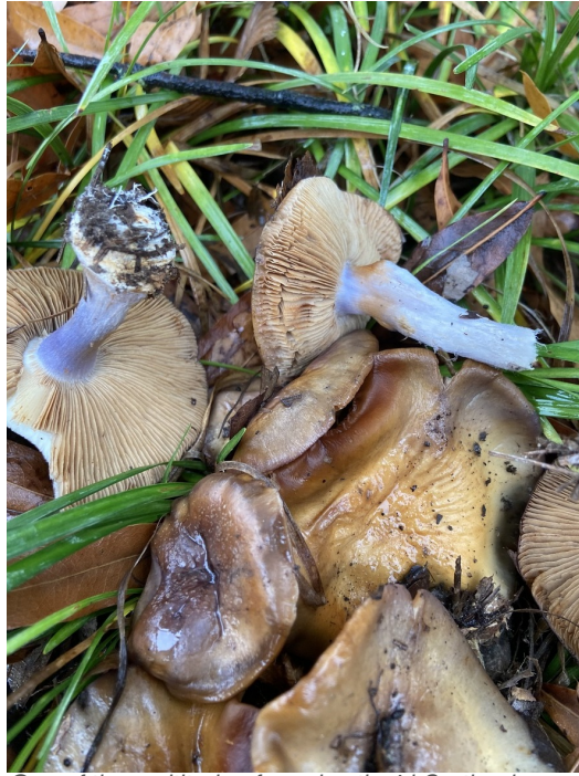
One of the multitude of purple stipe'd Cortinarius