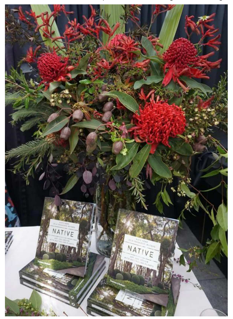
Copies of Native: Art and Design with Australian Plants under Kate Herd's flowers.

climate and of course, its performance in a garden setting.