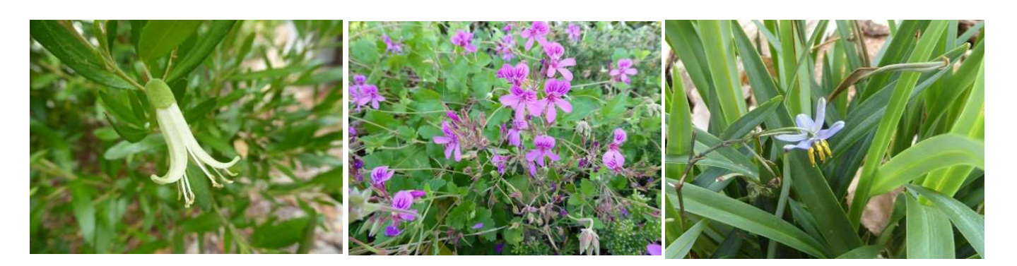
Some more January flowers - Correa glabra 'Coliban River', Pelargonium rodneyanum, Dianella 'Uralla', a delightful miniature plant

There are some weedy areas of my garden that I haven't yet incorporated into my plan – just not enough hours in the day. There have been losses due to absence, weather and poor choices. However, I'm definitely past the point of no return with this project and loving it.