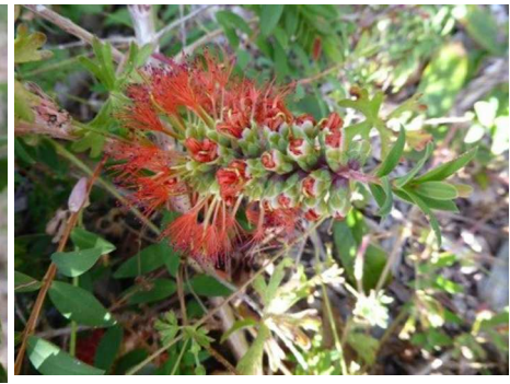
Hemiandra pungens showing promise as a ground cover; Regelia ciliata has lovely, neat foliage; Melaleuca hypericifolia 'Ulladulla Beacon'

I do like to clothe the walls and vertical structures with greenery and I hate to admit it but there had even been Ivy in this garden at some stage! I'm finding that Billardiera make good light climbers as long as they have support. So far I've been trying 6 species for suitability in Canberra, all of which seem easy to propagate, so far so good and I can replace those that may not survive their initial locations.