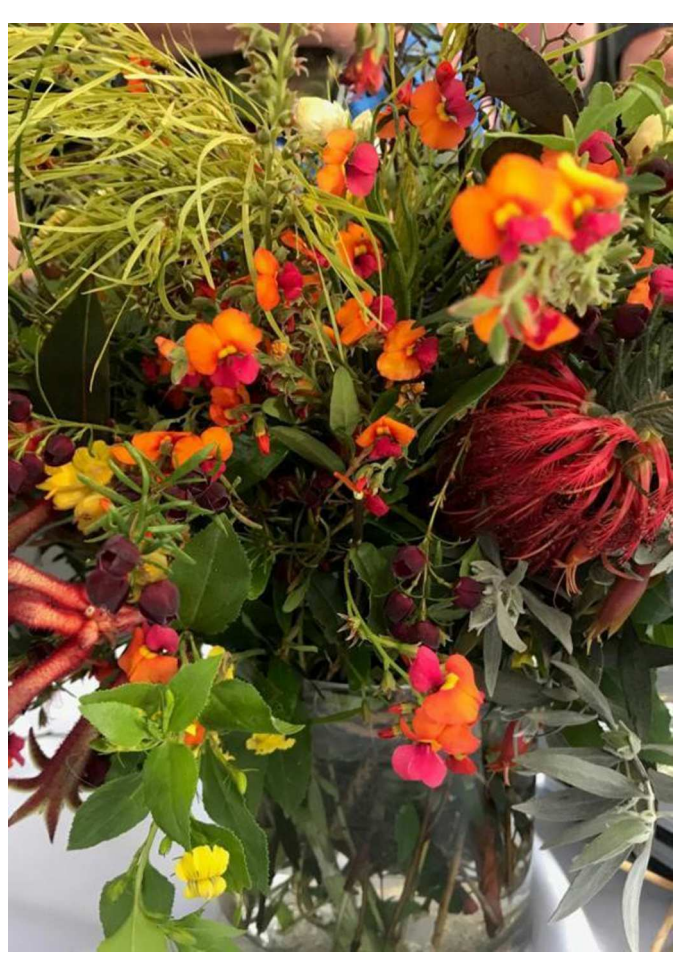
Hot coloured native flowers at the launch of Native.