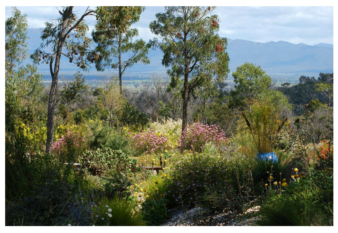
View across verticordia garden to Mount William Range

Property and area The property, Panrock Ridge, is an eastern ridge of the Black Range situated east of the Grampians and south of Stawell in central Victoria. It has a Trust for Nature covenant. Its total area of 200 acres has a rabbit-proof fence and, within this, between 30 and 40 acres has a modified covenant allowing some limited development. A feral-proof fence encloses this inner area, maintained to prevent the entry of all feral animals. Within this area again, 20 to 25 acres is more closely gardened.