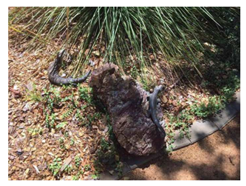
The gradual transformation of gardens beside the public footpath - Acacia 'Little Nugget' (is only little if I prune it), Melaleuca incana (dwarf, I think/hope), plumes of Dichelachne crinita ; Textures and colours of Brachyscome multifida , Chrysocephalum apiculatum and Kunzea 'Badja Carpet' wrapping around a rock; Life imitating Art, will the real Blue Tongue Lizard please stand up?

Challenges included a very large amount of lawn which I've gradually reduced to a small area in the back garden. Being a compulsive plant collector, it's not hard to fill up such spaces so I need to try to apply good design principles to make sure that these new gardens are worthy of the hard work of getting rid of so much lawn. Early failures with Grevilleas in some former lawn areas made me wonder if there might have been some residue of Phosphorus from lawn fertilisers. I persevered with them and other Proteaceae and over time assume that the Phosphorus has been leaching out.