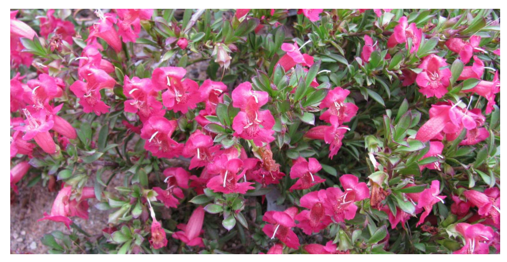
Hemiandra gardneri in the Marriott garden

Similarly most plant species are generally bioregionally specific and will not always establish well in different regions BUT the aesthetic form and character of plants know no geographic boundaries. Therefore it is usually possible to find a local substitute species with similar aesthetic characteristics to a plant that is not suitable for your region.