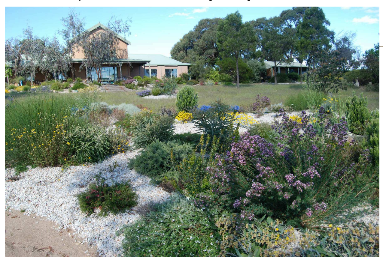
View of house and cottage from verticordia garden

These aims collectively have been the focus of the design of this garden.