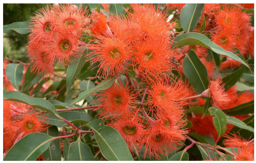
Grafted Corymbia ficifolia in the Marriott garden

Ros Walcott ACT – garden arrival and first impressions are fundamental; consider gates and walls, views, glimpses. Water sensitive design is a constraint but also an opportunity for appropriate garden design.