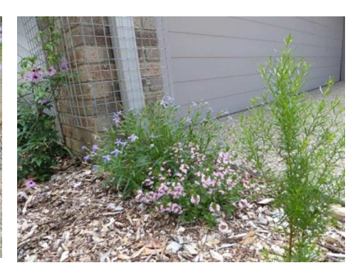
Eucryphia lucida, first flowers January 2018; Brachyscome multifida soften the edges where 3 hard surfaces meet. Note to self, propagate more Brachyscomes!; Replacing roses and a hedge, some 'pretties' I propagated, Isotoma axillaris and Scaevola humilis 'Sitting Pretty'. Pandorea jasminoides, Billardiera sp. (obscured) and Boronia 'Purple Jared' complete the picture

So, it's clear that I'm not immune to the disease of impulse purchases, many bought with wishful thinking during my travels, but I don't have too many other vices... Sometimes I try my hand at propagating from cuttings – a good insurance against loss as well as providing plenty of opportunities for repeat planting which will help to unify the look of the garden as they mature.