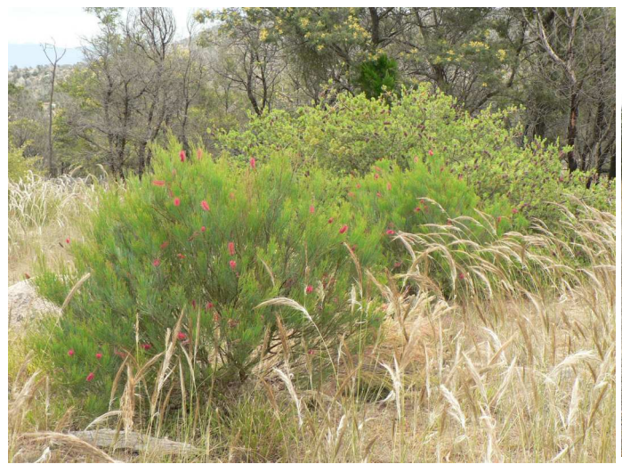
Austrostipa mollis with Grevillea oligomera

Large areas of native grasses are seen as a bonus, not a problem, and are used, where possible to show off, and contrast with, the non-indigenous plants grown in the adjoining gardens. These grasses are mown close to the gardens and for access, with large areas left till the end of spring for wildlife to nest in and the grasses to drop their copious seed for the native birds. Come early summer big areas are mown down for fire safety, although natural areas are still retained for wildlife.