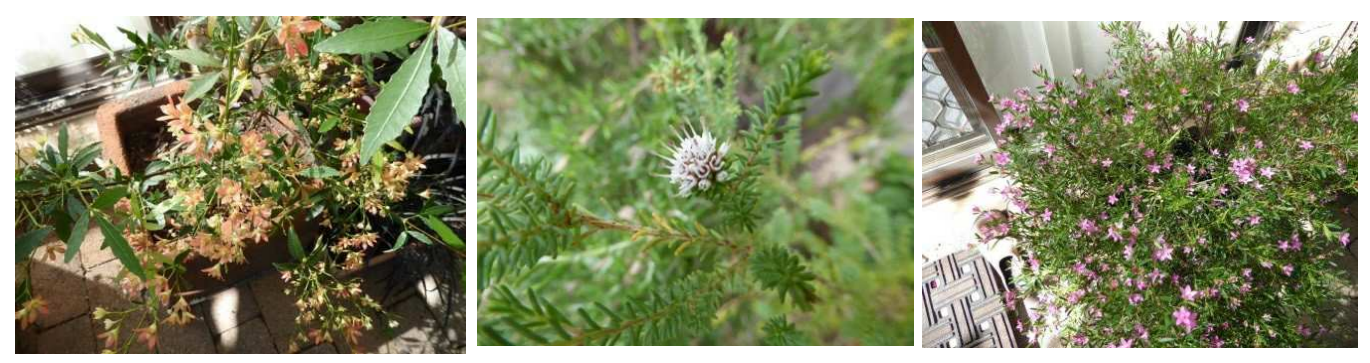
Ceratopetalum gummiferum 'Johanna's Christmas', Darwinia diosmoides, Crowea 'Ryan's Star', all in pots.

Many of my plants are grown in pots, some just to see how they survive the frosts as they wait out the winter under varying amounts of shelter, some because I'm almost certain they won't be happy in Canberra clay soil. There are often 'spares' coming along from my propagation efforts, just in case. Crowea 'Ryan's Star' was successful last year so I'm now trying four in the ground.