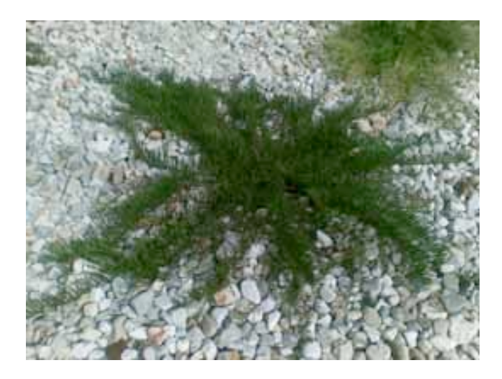
Neville explains that the plant is growing in a neighbourhood garden, and he has been watching it for about six months. When it was planted it was no bigger

Neville Marra (Horsham, Vic) has sent us the following photo of Acacia maxwellii (previously A. ramosissima ).