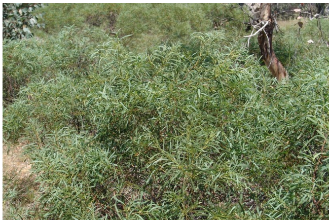
A. williamsonii x difformis ?

“While in the Whipstick Forest (Kamerooka section) today looking for different flower colours in Prostanthera aspalathoides and Grevillea rosmarinifolia I came across an Acacia which I think may be an A. williamsonii x A. difformis , although they usually flower at different times, see attached photos. The plant/plants were about 1 meter high and suckered vigorously covering an area of approximately 40 meters x 10 meters. I have seen some other suckering Acacias growing nearby which were taller growing and weeping. I think these are A. difformis x pycnantha .”