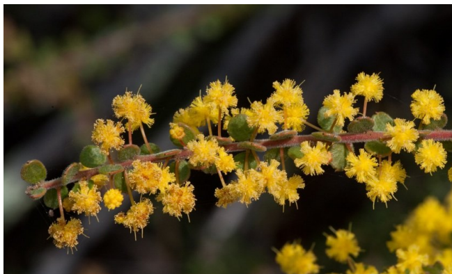
Acacia acinacea

We also found what seems to be a form of Acacia acinacea with round leaves up there?”