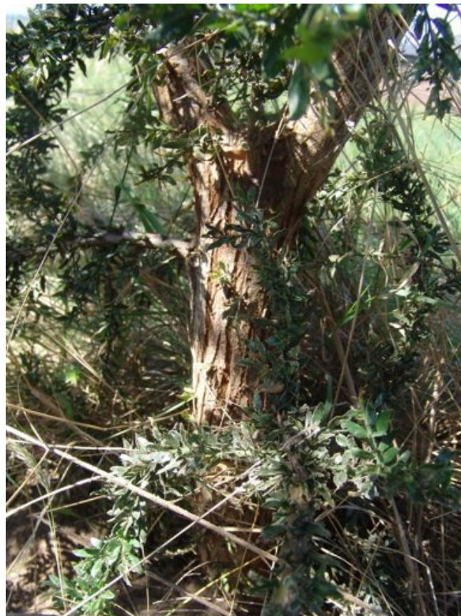
Acacia paradoxa under power lines

It is believed that lightning in thunderstorms “provides the intense energy needed to combine atmospheric nitrogen and oxygen into nitrates. The rain then carries these nitrates down to the earth’s surface enriching the soil. Acting as a fertilizer, nitrates in an indirect way helps make the grass green.” Is it possible that these HV power lines can do something similar possibly in a much lower rate but constantly over years?