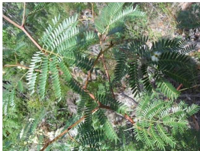
Foliage of A. terminalis , on dirt roads on way to Wingan Inlet, Croajingalong NP (probably along Cicada Trail)

The last trip undertaken was a weekend trip to Croajingalong National Park and again, Acacia terminalis was widespread and then in near full flower. Surprisingly it grew in all habitats including most roadside drives from forest, heath lands and to coastal foreshores. Looking back, the acacia did seem slightly different over the range of the parks visited and this is now understandably so with a number of subspecies having been identified.