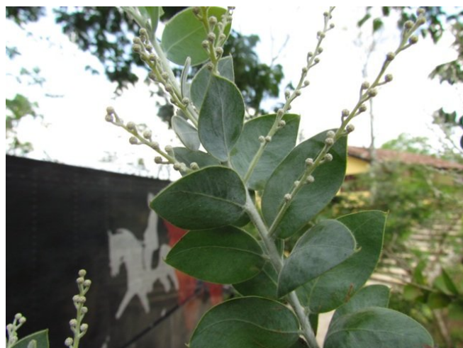
A. podalyriifolia, buds but no flowers

The minimum temperature over the year occurs in December and January (15°C) and then only for a few days.