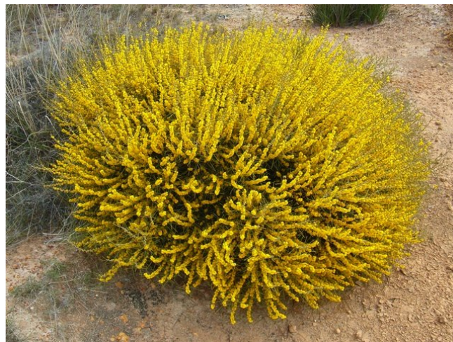
Maybe A. cracentis

and we therefore referred the photos to an Acacia expert. The advice that we received was that in the absence of a specimen or close up of the phyllodes, identification is tricky. Both images, and the advice received on possible identifications, are shown.