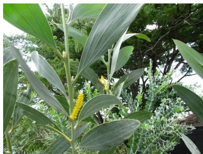
A. holosericea flowers