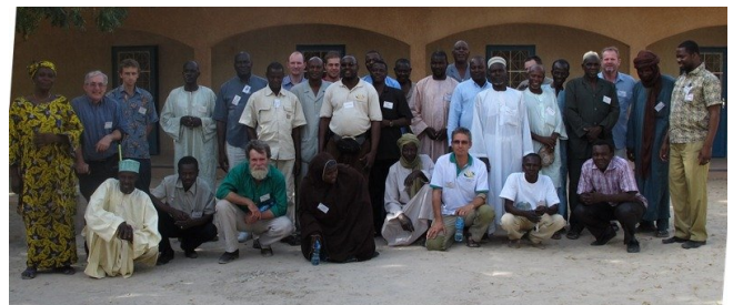
Participants in the 3 rd NEAN Meeting

A significant step forward occurred in 2010 with the formation of the Niger Edible Acacia Network (NEAN) - a group of organisations interested in developing and growing edible Acacias for multi-purpose use, including human food. This group has been meeting annually. The third NEAN meeting was held at Maradi from 1-2nd March 2012. There were 33 participants from four West African countries (Niger, Ghana, Senegal, Chad), representing nine organisations including seven Non Government Organisations (NGO’s), one government organisation and farmer groups present. Following a review of the NEAN vision statement, presentations from key food security and Acacia specialists with World Vision (WV) Australia outlined the use of Acacias for improving food security in the Sahel, progress on Acacia foods and their use in farming systems and the restoration of degraded lands. Local farmers also shared their successes and challenges of growing/using edible Acacias.