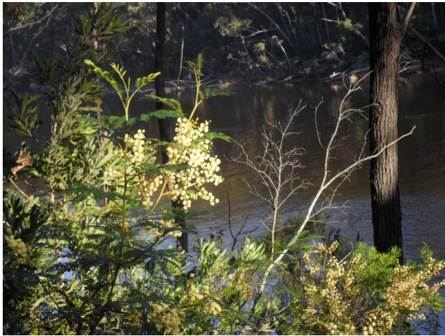
A. terminalis ssp angustifolia at Tamboon Inlet, Croajingalong NP

The Worldwide Wattle website describes the subspecies ‘ longiaxialis ’ as growing up to 3m. Subspecies angustifolia is said to grow to 6m (including in Croajingalong NP) and subspecies aurea grows to 2m (samples in Budawang NP). The species is said to be easily propagated from seed with the usual hot water treatment but the plant may be short-lived due to attacks from borers. I have recently obtained two small plants (locally) and some seeds from the study group, so I am interested to see how they go.