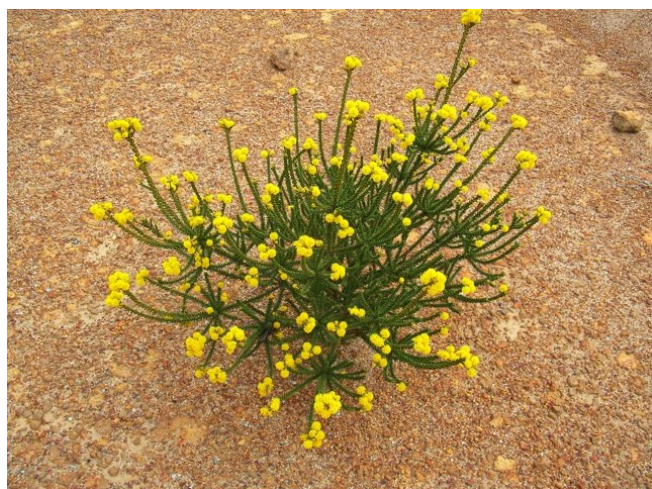
Maybe it is one of the subspecies of A. sedifolia