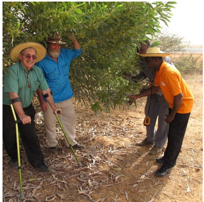
Acacia colei with a heavy seed crop, near Maradi, Niger

Rinaudo outlined the use of Wattle Seed in Niger (see ASGN No. 116) and although small in scale (approx 1000 people, 4 tonnes seed produced/annum) there was great potential to improve food security by the development and use of edible Acacias which are well adapted to the harsh conditions in the Sahel.