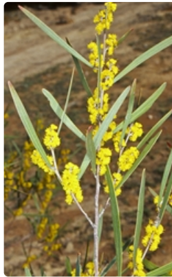
Flowering stem Quambean Nature Reserve near Queanbeyan