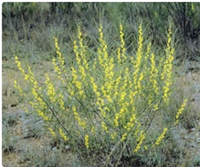
Shrub. Jerrabomberra NSW