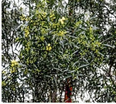
Shrub. north of Tathra