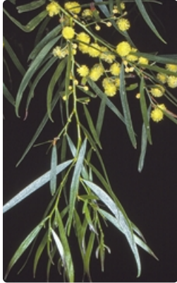
Flowering stems and 'leaves'. Photographer Don Wood, between Bermagui and Tathra