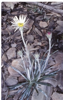
Flowering plant. Namadgi National Park, ACT