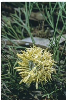
Flower head and leaves.