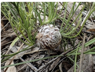
Fruiting cone.