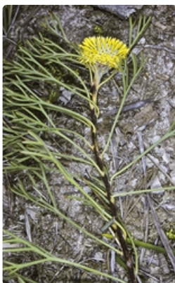
Flowering stem. Ben Boyd National Park south of Eden