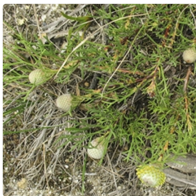
Branches with flowers in bud. Ben Boyd National Park south of Eden