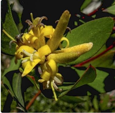
Flower cluster.