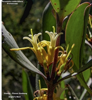
Flower cluster and leaves.