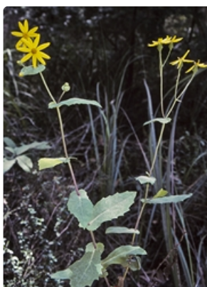
Flowering plant. East Boyd State Forest south of Eden