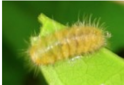
Photo 9. Pre-pupa, Phyllocharis undulata .