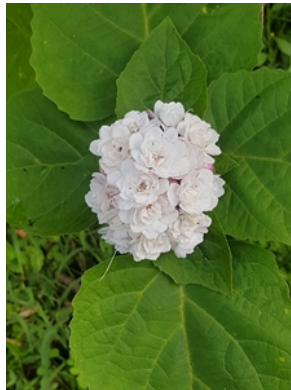
Photo 5. Honolulu rose, Clerodendrum chinensis , close-up of flowers.

When using a pesticide, always wear protective clothing and follow the instructions on the product label, such as dosage, timing of application, and pre-harvest interval. Recommendations will vary with the crop and system of cultivation. Expert advice on the most appropriate herbicides to use should always be sought from local agricultural authorities.