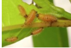
Photo 8. Larvae, Phyllocharis undulata .