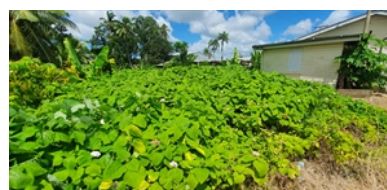
Photo 2. Honolulu rose, Clerodendrum chinensis , as an extensive monoculture.