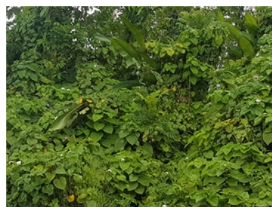
Photo 3. Honolulu rose, Clerodendrum chinensis , among other weeds and under shade along a roadside.