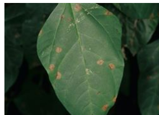
Photo 1. Leaf spot of Cercospora canescens on long bean.

Look for the brown round to angular spots on the older leaves with greyish centres and darker margins, up to 1 cm diameter.