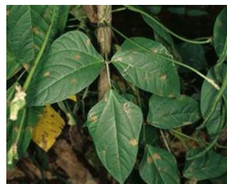
Photo 2. Leaf spot of Cercospora canescens on long bean.