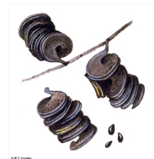
Fruit, three views and seeds. © W. T. Cooper