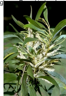
Leaves and Flowers.