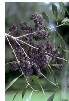
Leaves and fruit.