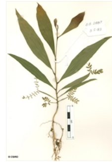
10th leaf stage. © CSIRO