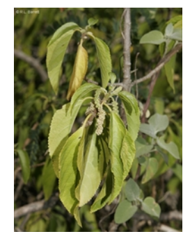
Leaves and male inflorescence.