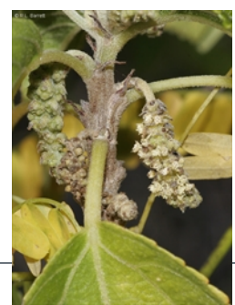
Male inflorescence. © R.L. Barrett