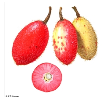
Fruit, side views and cross section. © W. T. Cooper