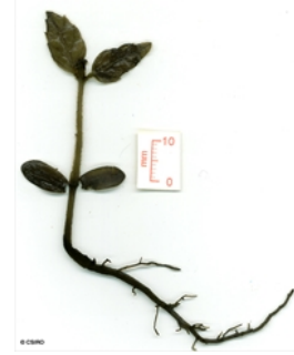
Cotyledon stage, epigeal germination.