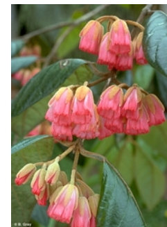
Leaves and Flowers.