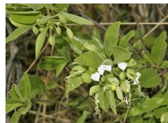
Leaves and flowers.