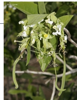
Flowers and fruit.