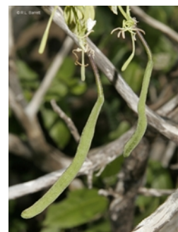
Fruit.