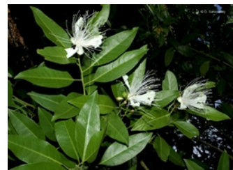
Leaves and flowers [not vouchered].