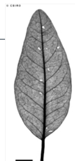
Scale bar 10mm.