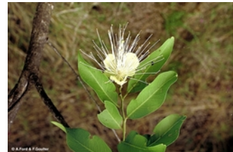
Leaves and flower.