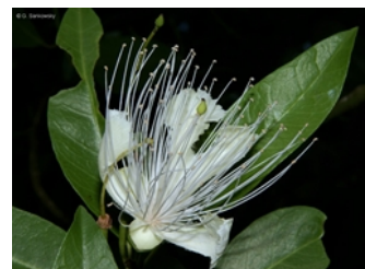
Flower [not vouchered].