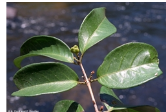
Leaves and fruit.