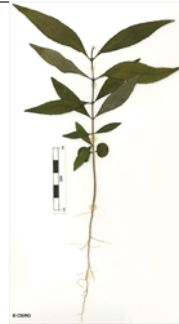
10th leaf stage.