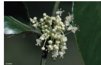
Male flowers. © CSIRO