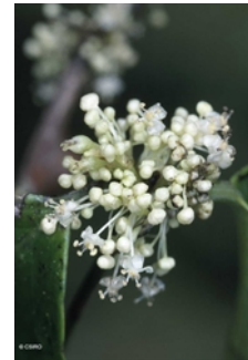
Male flowers.