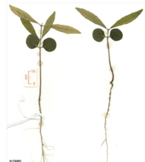
Cotyledon stage, Epigeal germination.