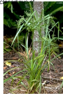
Habit, leaves and inflorescence.