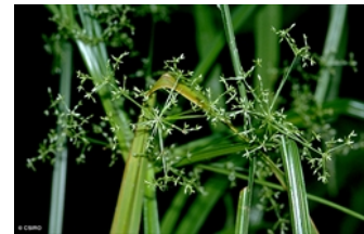
Spikelets and flowers.