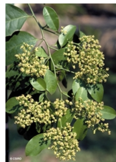
Leaves and Flowers.