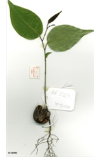
Cotyledon stage, hypogeal germination.