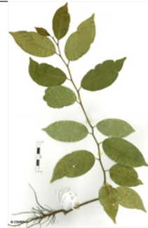
10th leaf stage.