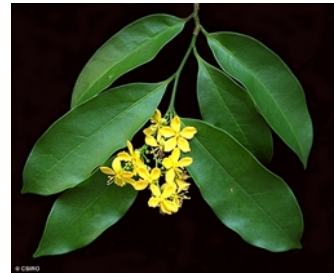
Leaves and Flowers.