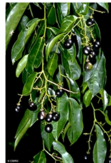
Leaves and fruit.