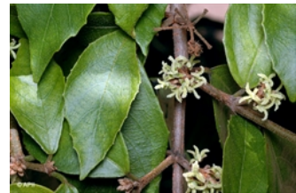
Leaves and female flowers.