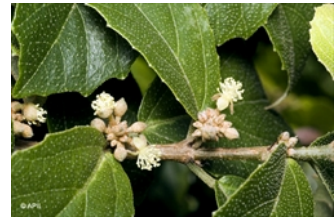
Leaves and male flowers.