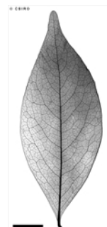
Scale bar 10mm.