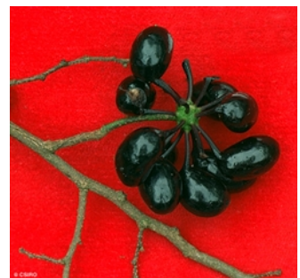
Fruit, side view.