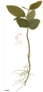
Cotyledon stage, epigeal germination.