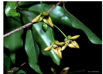
Flowers [not vouchered]. © G. Sankowsky