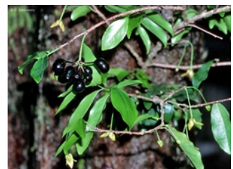
Leaves, flowers and fruit [not vouchered]. © G. Sankowsky