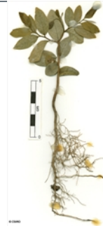
10th leaf stage.