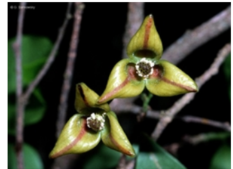
Flowers [not vouchered].