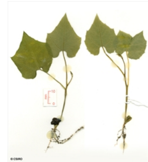
Cotyledon stage, hypogeal, semi-hypogeal germination.