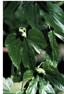
Leaves and juvenile fruits.