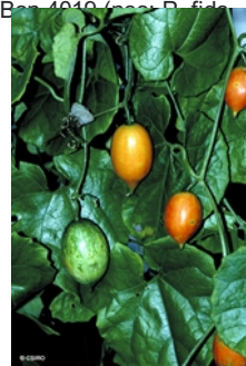
Leaves and fruit.