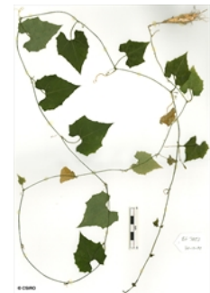
10th leaf stage.