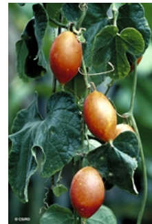
Leaves and fruit.