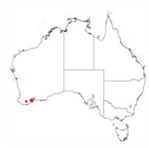
Acacia acellerata occurrence map. Occurrence map generated via Atlas of Living Australia ( https://www.ala.org.au ).