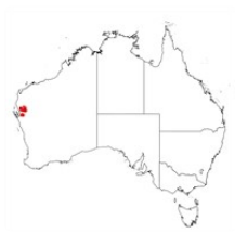
Acacia anastema occurrence map. Occurrence map generated via Atlas of Living Australia ( https://www.ala.org.au ).