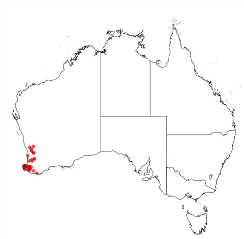
Acacia gilbertii occurrence map. Occurrence map generated via Atlas of Living Australia ( https://www.ala.org.au ).