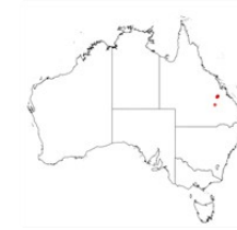
Acacia hendersonii occurrence map. Occurrence map generated via Atlas of Living Australia ( https://www.ala.org.au ).