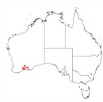
Acacia improcera occurrence map. Occurrence map generated via Atlas of Living Australia ( https://www.ala.org.au ).