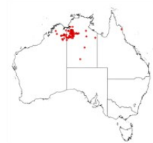
Acacia leptophleba occurrence map. Occurrence map generated via Atlas of Living Australia ( https://www.ala.org.au ).