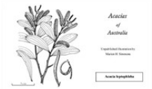
See illustration.