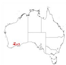
Acacia nivea occurrence map. Occurrence map generated via Atlas of Living Australia ( https://www.ala.org.au ).