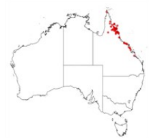
Acacia oraria occurrence map. Occurrence map generated via Atlas of Living Australia ( https://www.ala.org.au ).