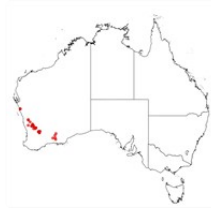
Acacia saxatilis occurrence map. Occurrence map generated via Atlas of Living Australia ( https://www.ala.org.au ).