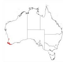
Acacia scalpelliformis occurrence map. Occurrence map generated via Atlas of Living Australia ( https://www.ala.org.au ).