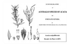
See illustration.