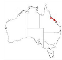
Acacia spirorbis subsp. solandri occurrence map. Occurrence map generated via Atlas of Living Australia ( https://www.ala.org.au ).

See illustration.