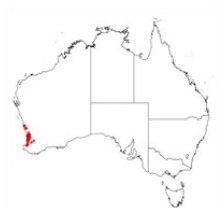
Acacia teretifolia occurrence map. Occurrence map generated via Atlas of Living Australia ( https://www.ala.org.au ).