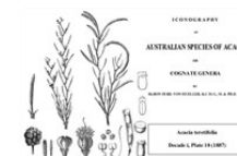
See illustration.