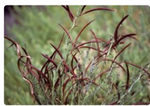
Source: WorldWideWattle ver. 2. Published at: www.worldwidewattle.com B.R. Maslin