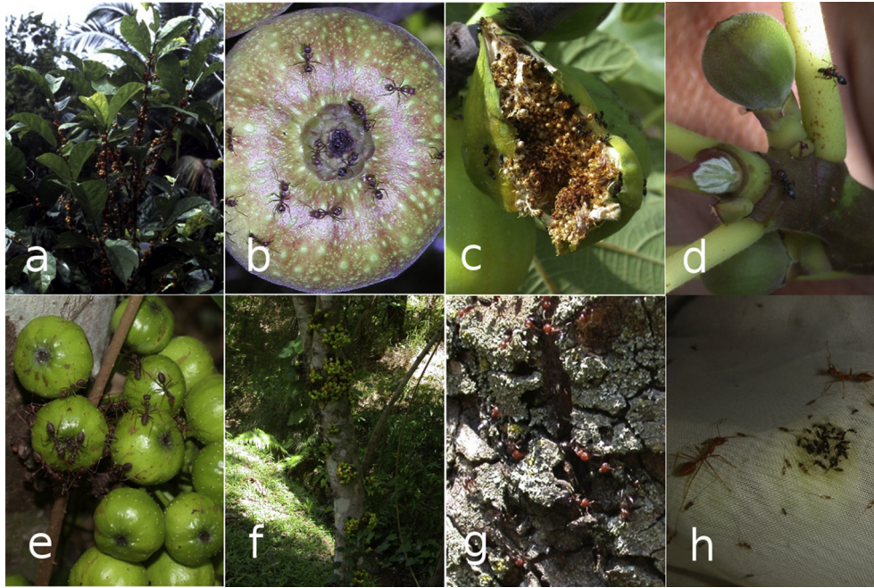
Fig. 2. a) Ficus pisifera on Borneo. b) Ants on syconia of Ficus oligodon in Thailand at the wasp emerging phase. Different behaviors of Crematogaster scutellaris ants on Ficus carica figs in France; c) workers collecting various food items in an opened syconia; d) a foraging worker and another capturing a pollinator. e) Oecophylla ants on a cauliflorous bunch of syconia of Ficus fistulosa in Brunei. f) Cauliflory on the trunk of F. fistulosa . g) Nest entrance of Crematogaster scutellaris in a dead part of the trunk. h) Bag containing receptive figs of F. racemosa , then attracting pollinators, NPFWs and Oecophylla ants as opportunistic predators during an experiment in India (Photos a–b from R.D. Harrison, c–g from B. Schatz, and h from M. Proffit).

species each, 21%). No observations of nesting ants have been reported from the subgenus Synoecia , but this possibly reflects the fact that these are climbers and poorly studied in general. Altogether, 16 ant genera have been observed nesting in 19 fig species (Table 3). Crematogaster , which frequently displays an arboreal life style (Hölldobler and Wilson, 1990), was the most commonly documented and has been recorded nesting on 11 Ficus species (11 out of 32 ant nesting observations, 34%). Oecophylla ants have been observed nesting on four fig species (4 out of 32 observations, 13%), and Camponotus and Cardiocondyla ants both on two species (each 6%). As result, Myrmicinae was the most common subfamily nesting in fig trees (20 out of 32 observations, 63%), followed by Formicidae (9, 28%), Dolichoderinae (2, 6%) and Ponerinae (1, 3%).