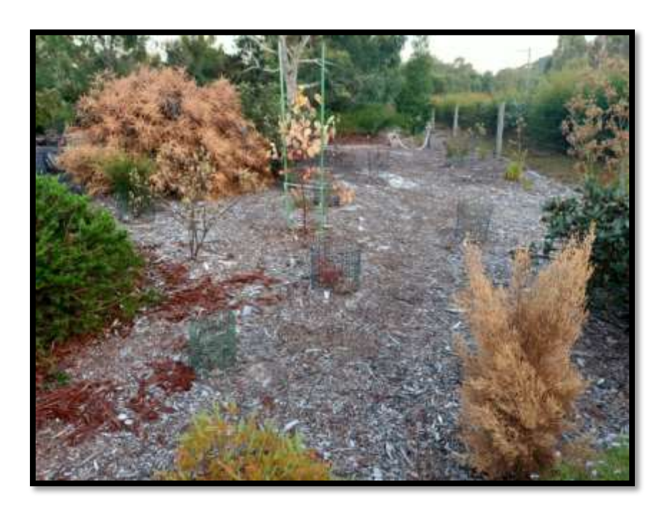
But now a happier lot:

Here is one of the sadder sights a gardener can imagine. Ray can't even blame the rabbits this time.