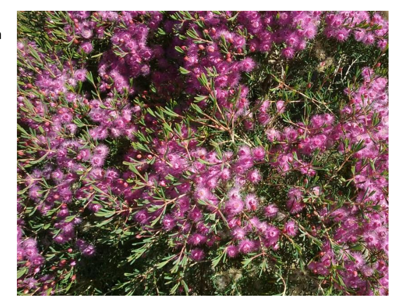
From Amanda: currently flowering, Eucalyptus alatissima, a small mallee tree 4-8m