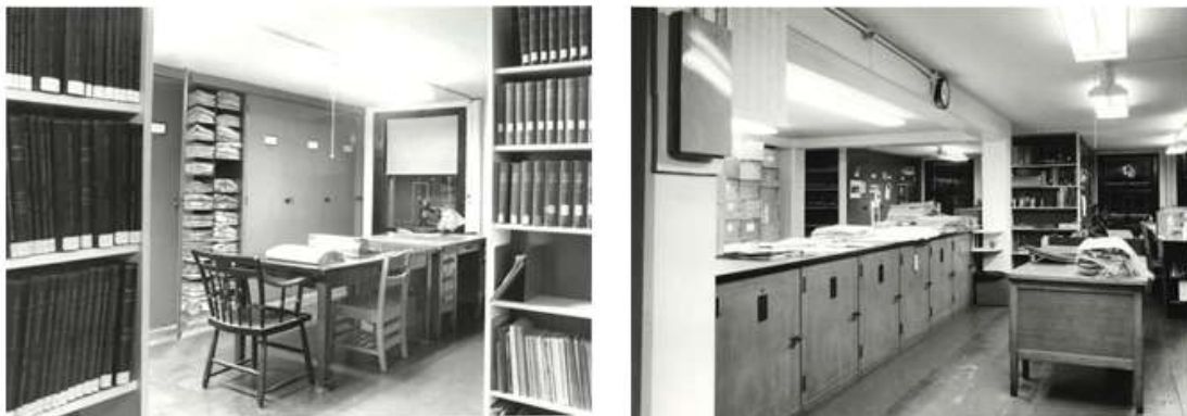
Arnold Arboretum Herbarium, second floor Hunnewell Building, January 7, 1991.