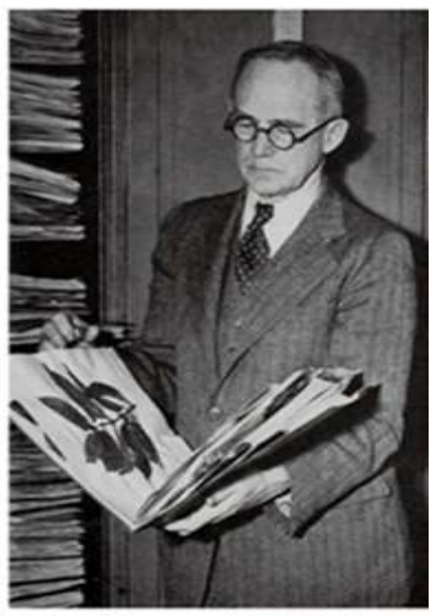
In the Arboretum's Herbarium c1940s

decisions. Numerous letters to Harvard administrators include discussions regarding the Case Estates, Atkins Institute, Bussey Institution, Gray Herbarium, Harvard Forest, Innisfree Estate, the Rose Garden Fund, the Rock Garden Fund, staff appointments, and fundraising. Topics covered in the material include fundraising, grants for botanical field work, herbarium expansion and specimen loans, plant collecting expeditions and subscription, plant identification and nomenclature, plant and seed exchanges, literature exchanges, and staff appointments. Also included are his interest in promoting plant collecting by native botanists, which produced herbarium specimens collected from China, India, Java, the Philippines, Japan, and elsewhere. Letters promoting collaboration with other institutions such as the Fairchild Tropical Garden, the Smithsonian, University of California, USDA, Duke University, New York Botanical Garden, Missouri Botanical Garden, Instituto Miguel Lillo-Argentina, Instituto Biologic-Colombia, Royal Botanic Gardens-Kew, Imperial Forestry Institute-England, Botanic Gardens Brisbane, and Australian National University are included.