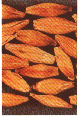
1. Kernel blight or black point on barley