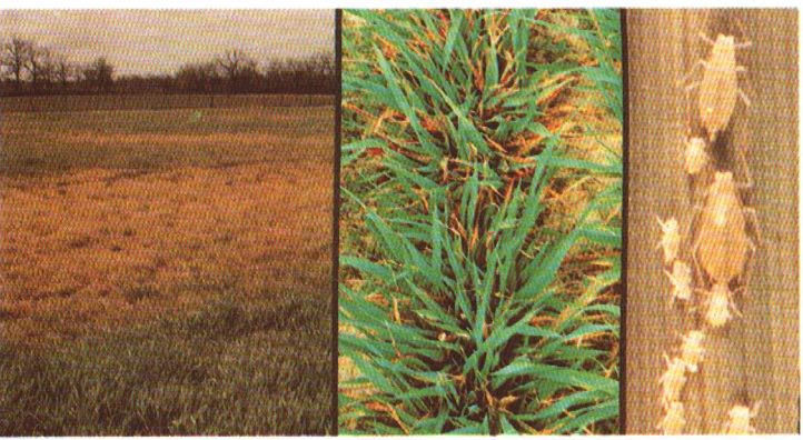
10. Barley yellow dwarf. L, field symptoms; C, plant symptoms; R, aphids