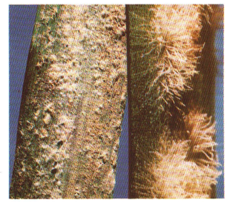
5. Powdery mildew on barley