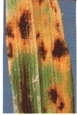
3. Net blotch on barley