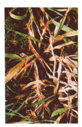
14. Typhula blight of barley