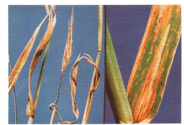
4. Helminthosporium stripe on barley