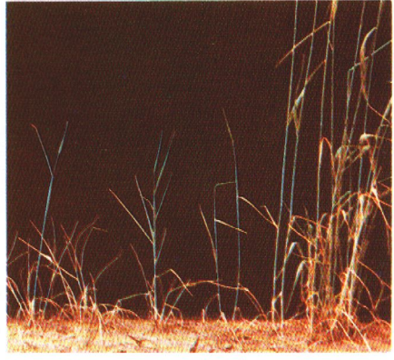
17. Take-all on rye