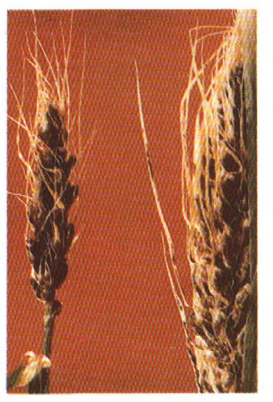
11. Loose and covered smuts of barley