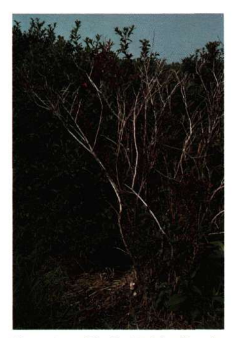
Fig. 25. Stem dieback of Rubel cultivar infected with blueberry leaf mottle virus.