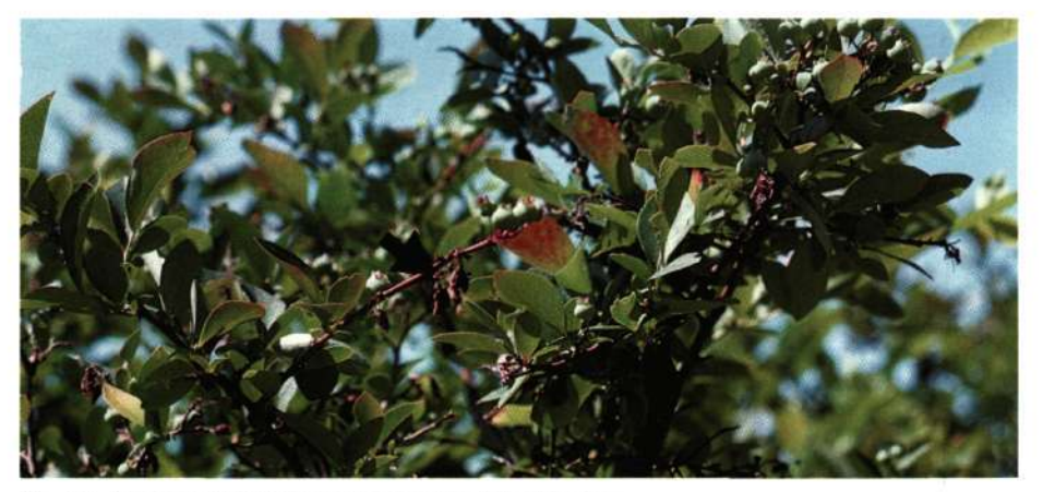
Fig. 10. Blossom blight (arrow) caused by Botrytis cinerea.