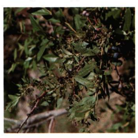
Fig. 24. Shortened stem internodes and small terminal leaves associated with necrotic ringspot disease on Concord and Stanley cultivars.

tension Bulletin E-154 for suggested soil fumigants and rates. In existing areas of infection, identify all infected bushes. After bush removal (including crowns and major roots) the soil must be worked for a full season. Fumigate in the autumn, by October 1, while the soil temperature is still above 55°F. Consult Extension Bulletin E-154 for soil fumigants and rates to be used. Use disease-free planting stock.