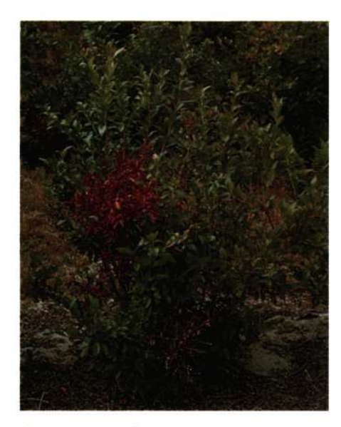
Fig. 6. Stem wilt and dieback caused by Fusicoccum canker disease.