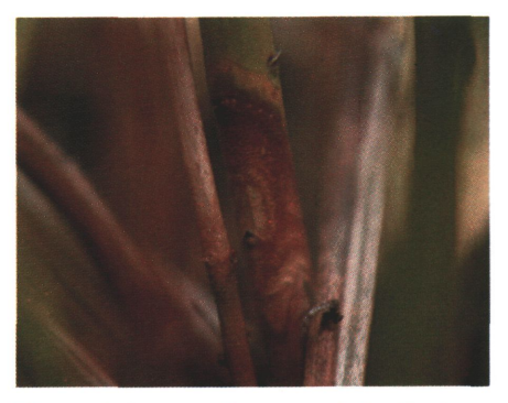
Fig. 5. A stem canker caused by Fusicoccum putrefaciens.

trefaciens). Infected stems (current season, 1-, 2-year old) develop elliptical, brownish-purple lesions 1 to 6 inches long (Fig. 5). The lesions are found in the lower third of the bush, especially in the crown area. They contain small black pimple-like fungal fruiting bodies called pycnidia. The pycnidia contain conidiospores that infect more canes when they are rain splashed. Infection eventually results in wilting and dieback of the whole stem, (usually in mid-summer) (Fig. 6), due to a damaged vascular system.