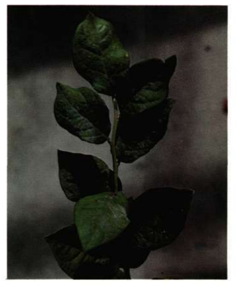
Fig. 17. Powdery mildew infected leaves. Note puckered leaves with whitish fungus mycelium on the surface.

Make sure that nursery plants are free of crown gall. At planting time, dip the