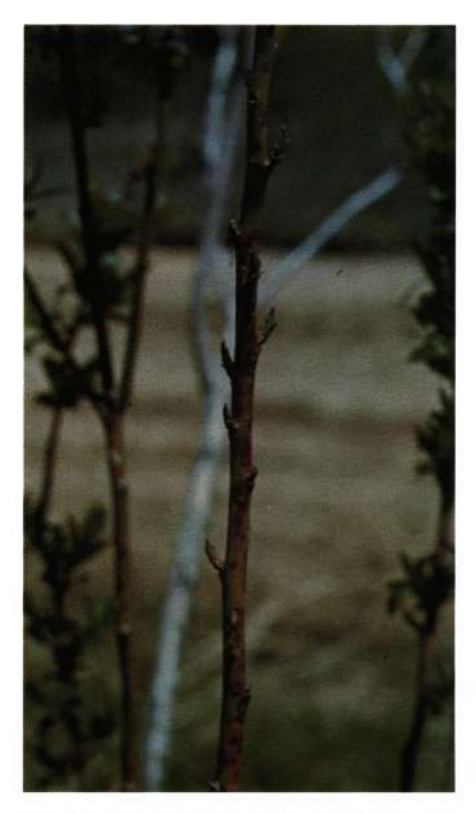
Fig. 29. Red ringspot stem symptoms on Blueray cultivar infected with red ringspot virus.