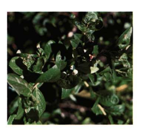
Fig. 23. Necrotic and deformed leaves on a bush diseased with Necrotic ringspot, caused by tobacco ringspot virus.