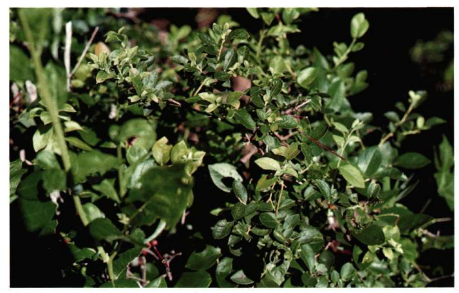
Fig. 27. Small, pale leaves of Jersey cultivar infected with blueberry leaf mottle virus.

The disease spreads fairly rapidly in plantings. Over a ten year period an infection can increase in a field from very few infected bushes to more than 50% infection. The disease is not associated with the dagger nematode or with aphids. There is a strong possibility that blueberry leaf mottle is spread from one bush to another via pollen. Diseased propagating wood is another possible means of spread.