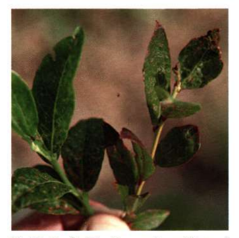
Fig. 26. Leaf distortion and mottling of Rubel cultivar infected with blueberry leaf mottle.

duced in infected Jersey bushes. There is potential for confusion between this disease and necrotic ringspot, because both diseases cause stem dieback. However, there are no necrotic leaf spots associated with blueberry leaf mottle disease.