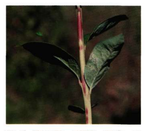
Fig. 21. Elongated reddish streaks on blueberry stems. This is the most reliable symptom of shoestring disease.

reddish streaks, 1/4-to-1-inch or longer on current year and 1-year old stems (Fig. 21).