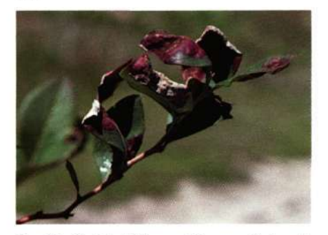
Fig. 16. Red leaf diseased leaves. Note reddish upper surface and whitish lower leaf surface.