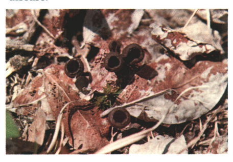
Fig. 2. Mushroom-like apothecia that germinate from mummyberries on the ground in the spring. These contain ascospores which cause shoot blight.