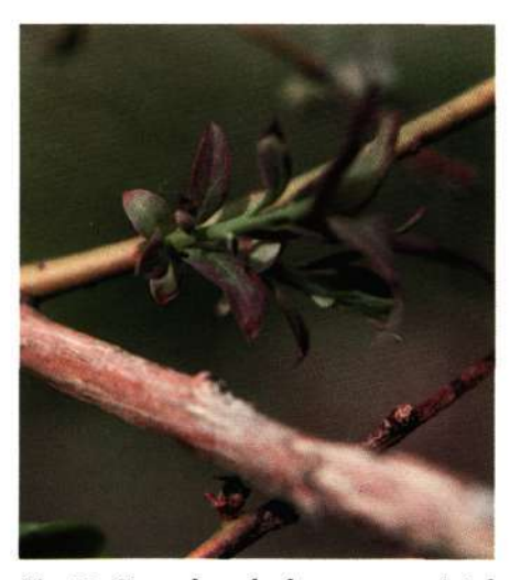
Fig. 19. Strap-shaped leaves associated with shoestring disease.

Shoestring is named for one of the symptoms associated with the disease; some leaves on infected bushes are strap-like (shoestring symptom) (Fig. 19). Usually a few clusters of leaves in the crown will show this symptom. Some will be misshapen in the form of crescents, or twisted (Fig. 20). The most reliable symptom is narrow, elongated