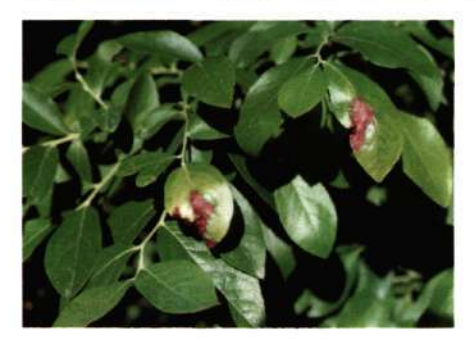
Fig. 11. Leaf necrosis caused by Botytris cinerea.