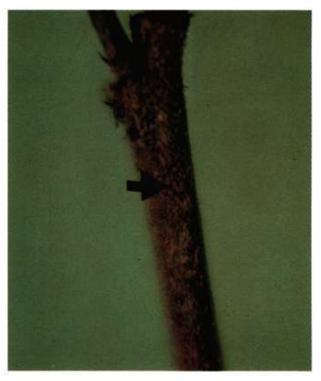
Fig. 8. Pimple-like pycnidia (arrow) on a Phomopsis canker. These pycnidia contain infectious conidiospores.

and spring frost injury afford an entry point for infection.