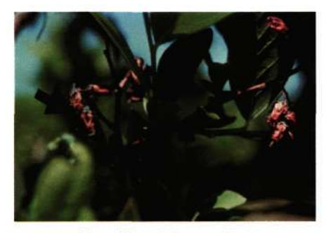
Fig. 12. Shoot blight/blossom blight (arrow) phase of anthracnose.

on the bush by rain or after harvest, when one fruit touches another.