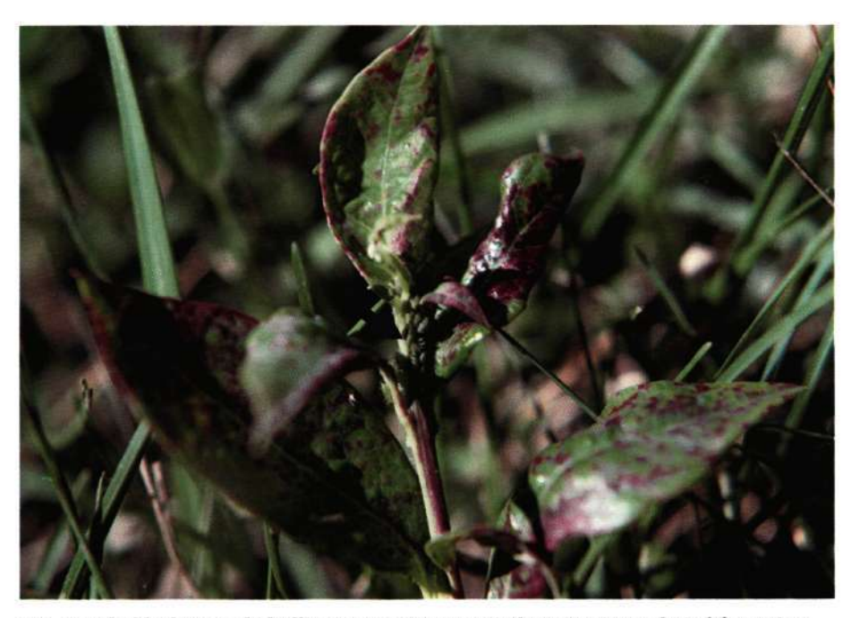
Fig. 22. The blueberry aphid, Illinoia pepperi (arrow) is the vector (spreader) of shoestring disease.

Test the soil for the presence of dagger nematodes (See MSU Extension Bulletin E-800 for directions on how to properly take soil samples) before planting. If dagger nematodes are present, then use a pre-plant soil fumigant. Consult Ex-