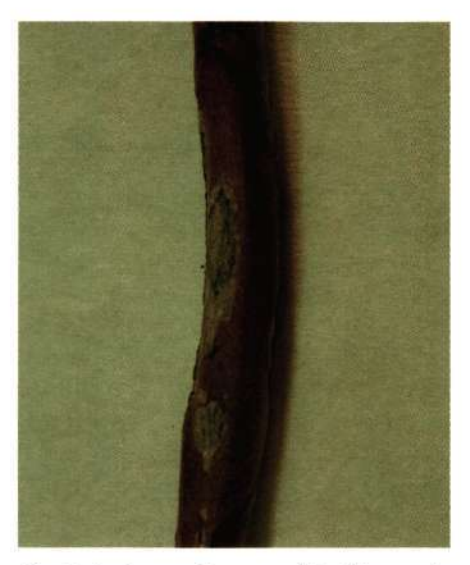
Fig. 7. A stem canker caused by Phomopsis vaccinii.

After the stems have been infected for a season, they will wilt during the summer months (Fig. 9). Under severe disease conditions it is common to see bushes with a half dozen or more wilting stems. The infectious conidiospores are spread each time rain occurs during the growing season from bud-break through about August 1. Winter injury