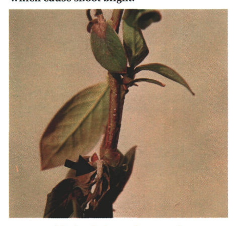
Fig. 3. A blighted shoot showing the cream colored sporulation (arrow). This sporulation contains conidiospore masses. The conidiospores infect the blossoms, causing mummyberries to form.