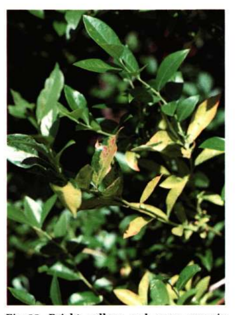
Fig. 28. Bright yellow and green mosaic symptoms on leaves of Rubel cultivar showing mosaic disease.

Red ringspot is a very important disease in New Jersey. A similar (if not identical) disease also occurs in cranberries in that state. In Michigan, red ringspot is a potentially important disease but it does not actively spread under field conditions. However, it is spread through the use of diseased prop-