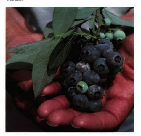
Fig. 31. Fruit spot symptoms sometimes associated with red ringspot virus infection.