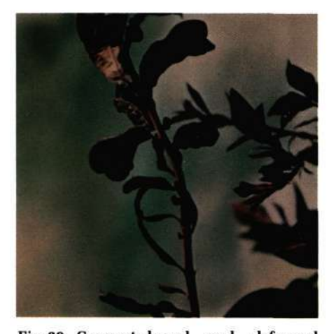
Fig. 20. Crescent-shaped and deformed leaves associated with shoestring disease.