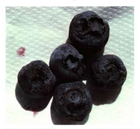
Fig. 15. Blackish, dark greenish sporulation on fruit diseased with Alternaria fruit rot.