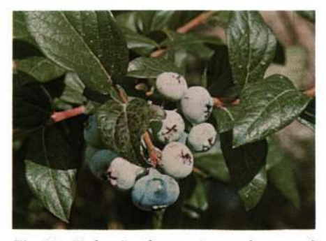
Fig. 30. Red, circular spots on leaves of Blueray cultivar infected with red ringspot virus.