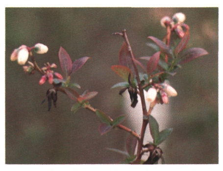
Fig. 1. Shoot blight phase of mummyberry

This disease is serious in the northern Lower and the Upper Peninsula. If an east-west line is drawn through Grand Haven, the area north of this line will be where Fusicoccum canker is a problem. The area south of this line is where