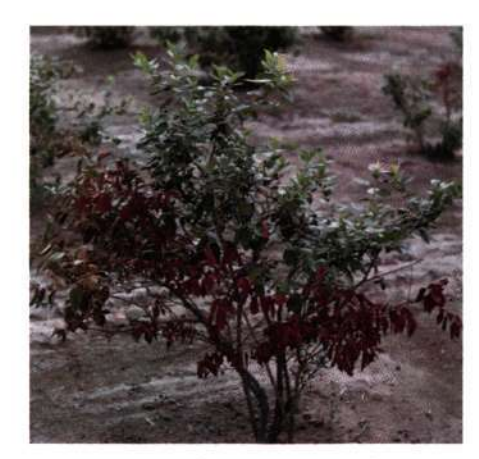
Fig. 9. Stem wilt caused by Phomopsis canker.

Botrytis blight, a sporadic disease, is caused by the fungus Botrytis cinerea . When conditions are favorable for the disease it can cause considerable crop loss.