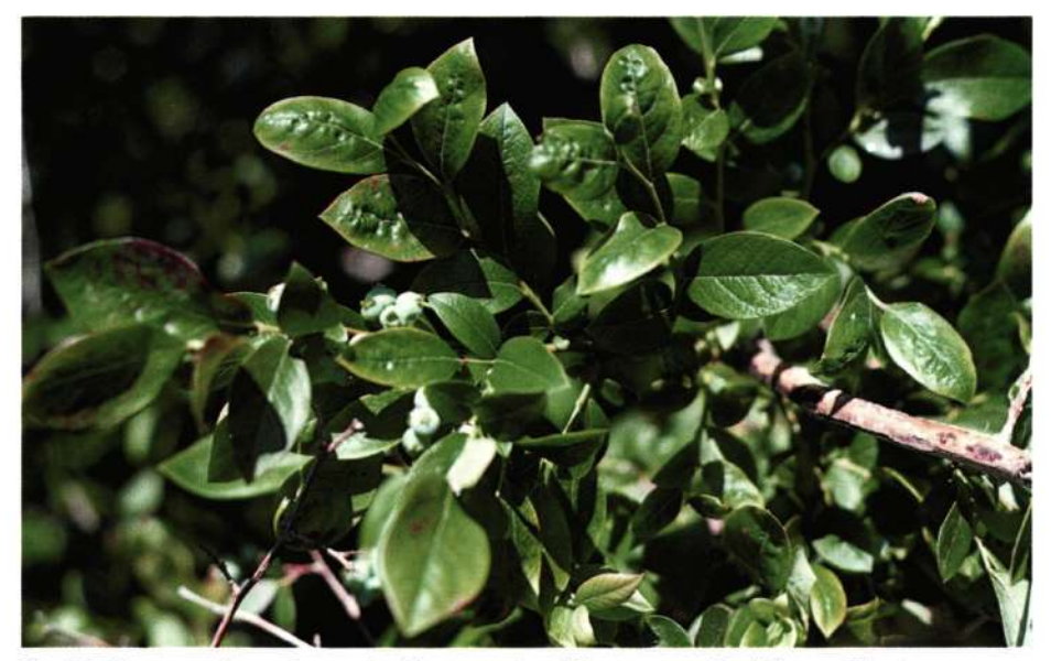
Fig. 32. Downward cupping and yellow margins of leaves on a stunt diseased bush.

Powdery mildew disease can also cause similar spots. However, powdery mildew spots go through the leaf, so that the underside is spotted also. Red ringspot lesions are only on the top side of the leaf. There is possible confusion because of a genetic disorder associated with the Bluetta cultivar. Dark, reddish spots can appear on this cultivar, which may be caused by either red ringspot virus or a genetic disorder. In this case, diagnostic tests such as the enzymelinked immunosorbent assay (ELISA) are necessary to determine whether the symptoms are caused by the virus or by a genetic disorder. Fruit will sometimes exhibit bleached out circular blotches (Fig. 31), although this symptom is not always present. Yield is reduced on diseased bushes, but the extent of the reduction is not known. A mealy bug is suspected of spreading the disease in New Jersey.