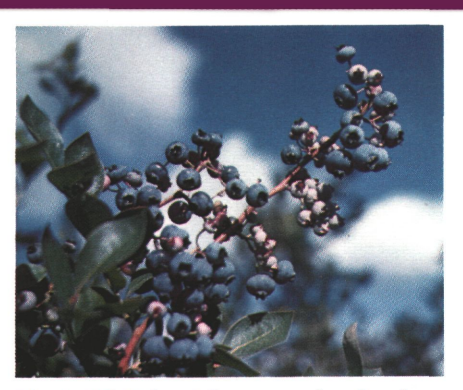
Fig. 4. Whitish pink mummyberries form among healthy blue fruit near harvest time.

This disease is caused by the fungus Godronia cassandrae (Fusicoccum pu-