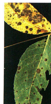
4. Walnut anthracnose