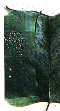
13. Aphids and sooty mold of tuliptree