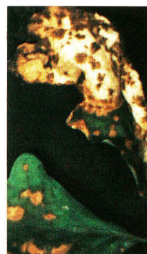
3. Anthracnose of white oak