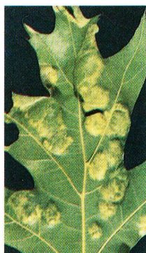
10. Oak leaf blister