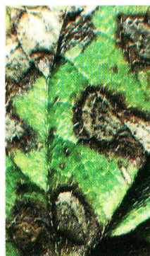
11. Hawthorn leaf blight