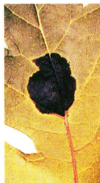
12. Tar spot of maple