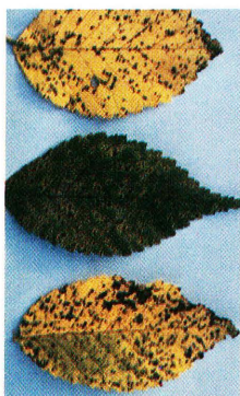
9. Black leaf spot (or anthracnose) of elm