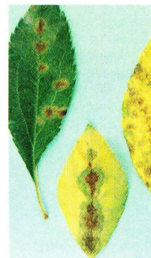
14. Crabapple scab