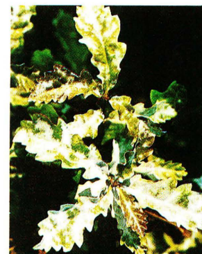
18. Oak powdery mildew