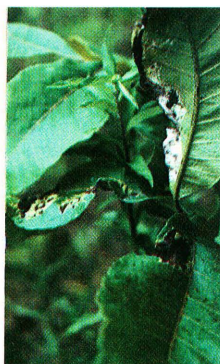
5. White mold or downy spot of walnut