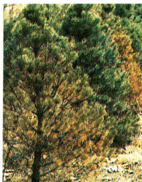
15. Lophodermium needle cast of scots pine