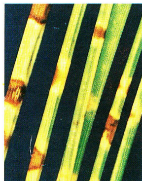
16. Brown spot needle blight