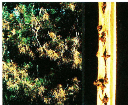
17. Diplodia tip blight on Austrian pine