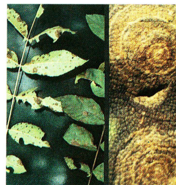
8. Cristulariella (or bull's-eye) leaf spot of walnut