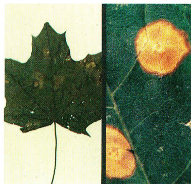
7. Phyllosticta leaf spot (or purple eye) of maple