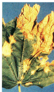
2. Maple anthracnose