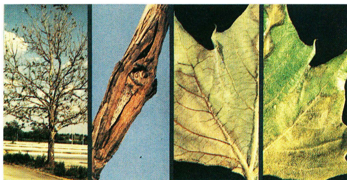
1. Sycamore anthracnose