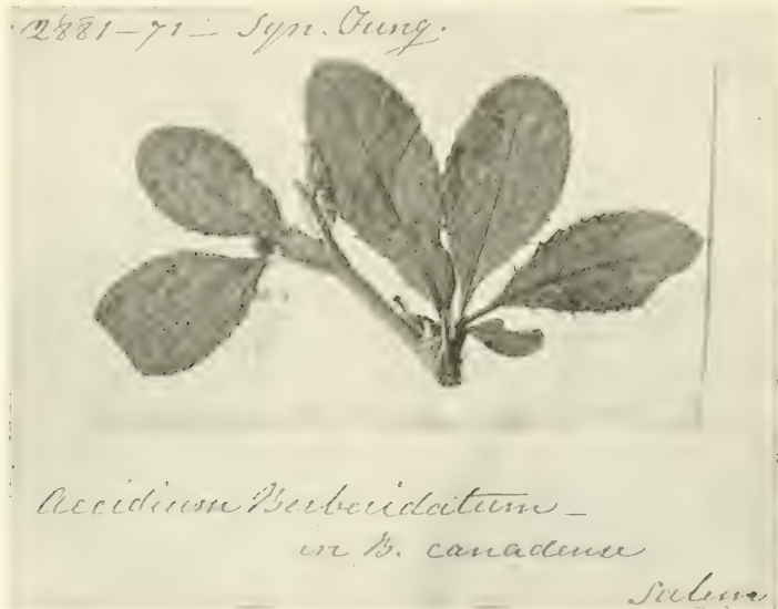
FIG. 1. From a photograph of the mounted specimen in the Academy of Natural Sciences of Philadelphia, basis of Schweinitz's No. 2881. Each specimen in the mounted set is treated essentially in the same manner. The writing was done by Michener. Engraved full size.

Represented by a mounted specimen of a stout, ash-gray stem, 3.5 cm. long, having two fascicles of leaves, two full-grown leaves in one fascicle and three in the other, each leaf 1.5 by 3 cm. or somewhat less, bearing a number of small groups of young æcia, one group only appearing mature (see cut). There is also an empty