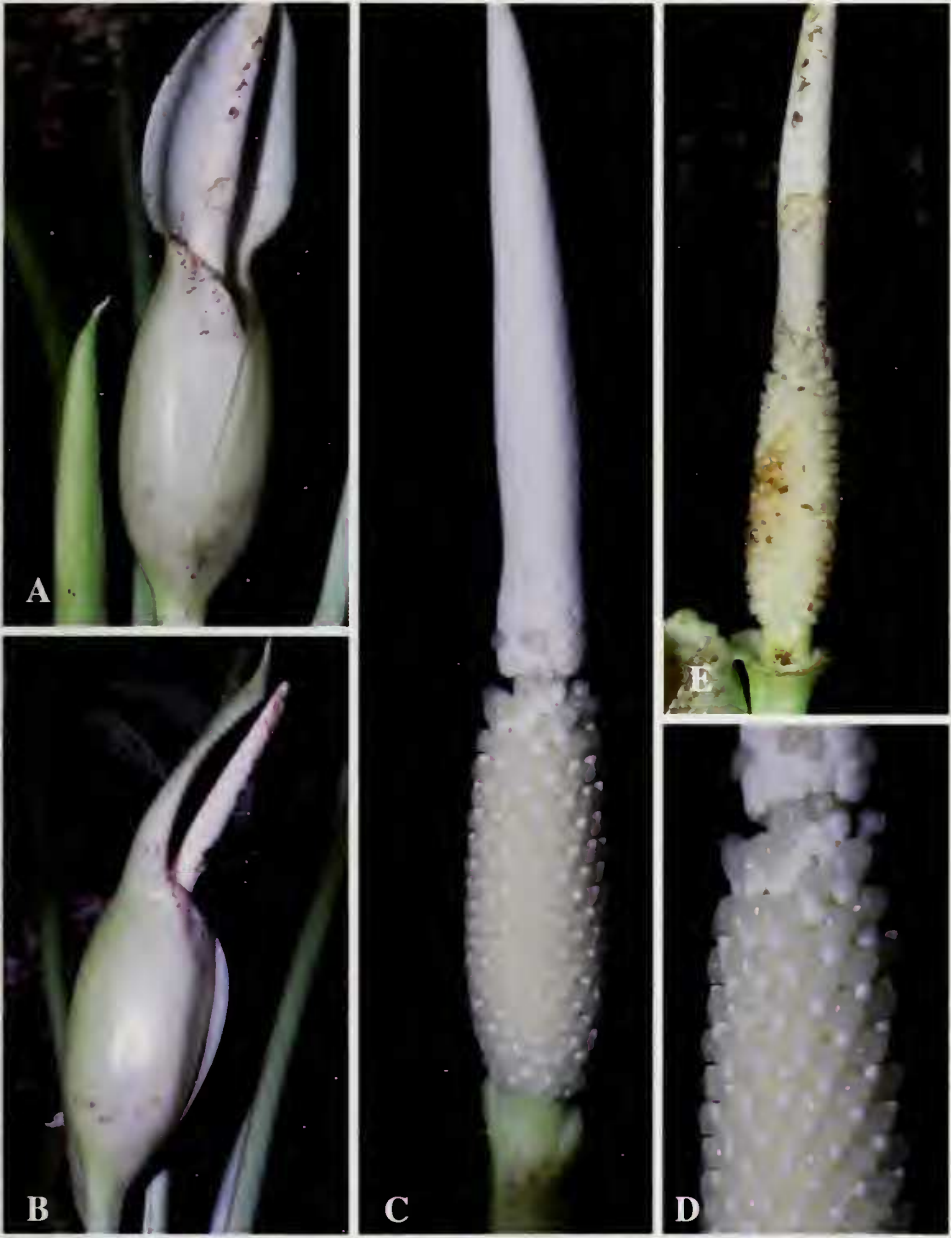
Figure 3. Homalomena clandestina P.C.Boyce, S.Y.Wong & Fasihuddin. A & B. Inflorescence at early male anthesis, note the damage to the male flower zone resulting from beetles chewing the spadix; C. Spadix at female anthesis (spathe artificially removed), note naked interstice between the male and female flower zones, the lax, ascending pistils, and separate stigmas; D. Details of the female flower zone and lowermost part of the male flower zone; E. Post-anthesis spadix, note the beetle-damaged male flower zone, and that the interpedicellar staminodes are now missing, having been eaten. All photos from P.C.Boyce et al. AR-2385 (SAR).