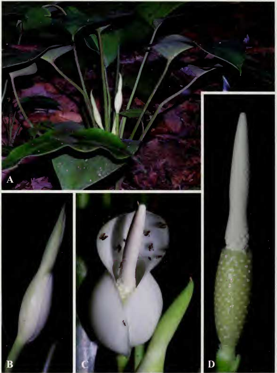
Figure 2. Homalomena borneensis Ridl. A. Flowering plant; B. Inflorescence just prior to female anthesis, note the entire spathe still tightly furled; C. Inflorescence at late female anthesis, note the inflated lower spathe and fully expanded spathe limb; the insects are Colocasiomyia (Diptera: Drosophilidae); D. Spadix at female anthesis (spathe artificially removed), note the dense pistils and coherent stigmas. A-B photos from P.C.Boyce et al. AR-544 (SAR); C-D photos from P.C.Boyce et al. AR-546 (SAR).