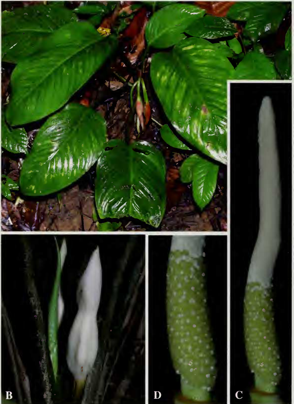
Figure 10. Homalomena symplocarpifolia P.C.Boyce, S.Y.Wong & Fasihuddin. A. Plant in habitat, note the oblong leaves; B. Inflorescence at late male anthesis; C. Spadix, spathe artificially removed to show the contiguous male and female flower zones; the lowermost flowers of the male zone are sterile; D. Detail of female flower zone. All photos from P.C.Boyce et al. AR-2411 (SAR).