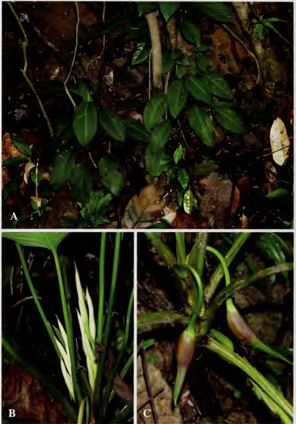
Figure 8. Homalomena pseudogeniculata P.C.Boyce & S.Y.Wong. A. Plant in habitat; B. Emerging inflorescence showing the distinctive mucro; C. Two infructescences. All photos from P.C.Boyce et al. AR-1583 (SAR).