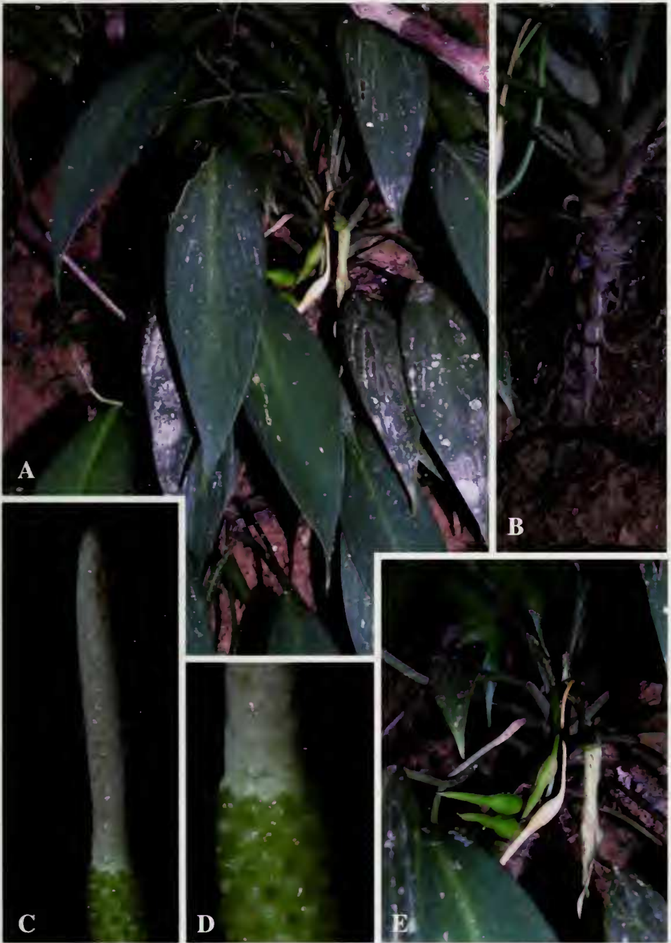
Figure 11. Homalomena vagans P.C.Boyce. A. Plant in habitat; B. Detail of the older part of the creeping stems; C. Spadix, spathe artificially removed; D. Detail of female flower zone, note the proportionately small stigmas; E. Inflorescences with the diagnostic declinate peduncle and erect spathe. All photos from P.C.Boyce et al. AR-2380 (SAR).