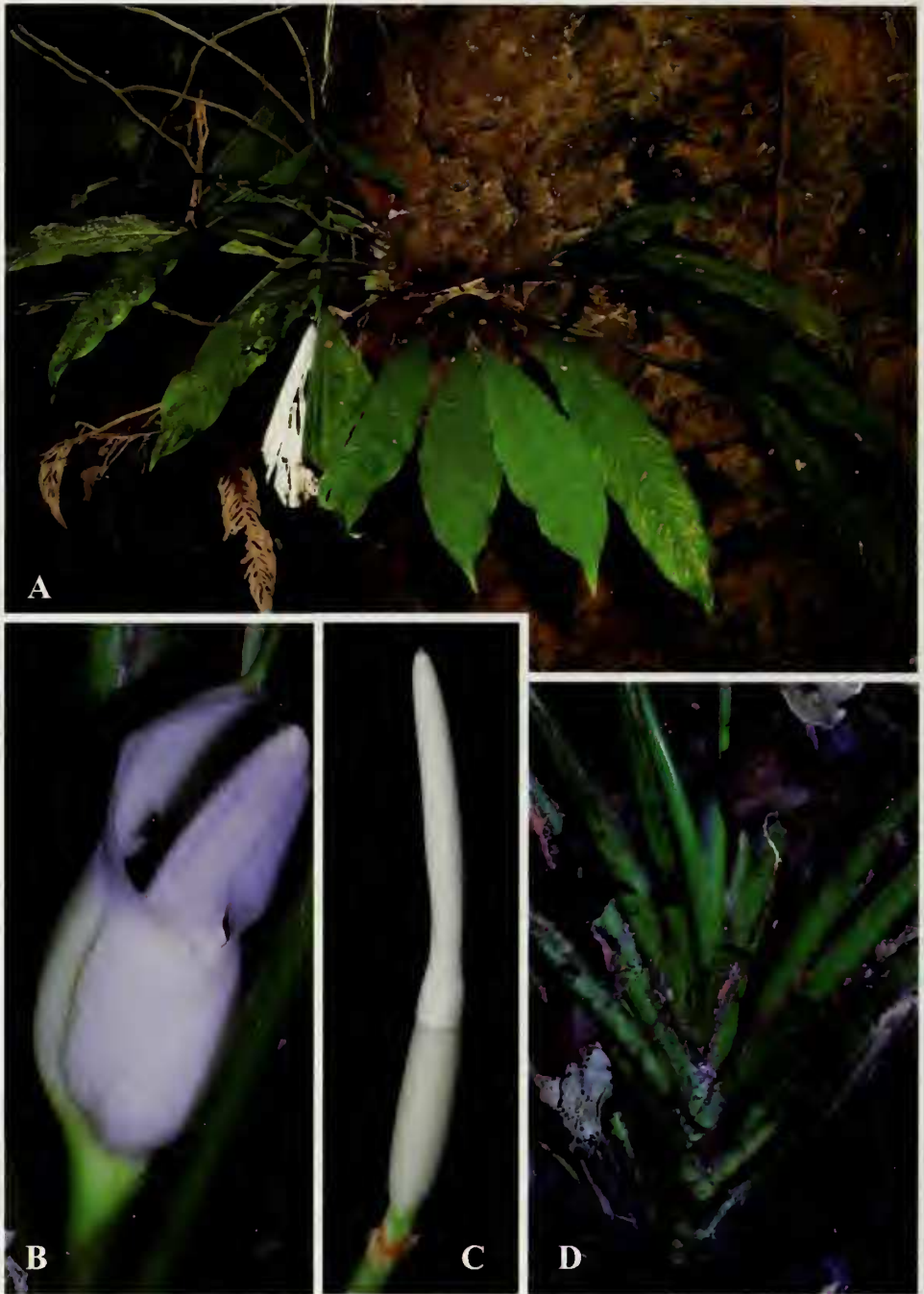
Figure 4. Homalomena geniculata M.Hotta. A. Plant in habitat; B. Inflorescence at female anthesis; C. Spadix at female anthesis, spathe artificially removed; note that there are no interpistillar staminodes; D. Detail of distichous leaf arrangement. All photos from P.C.Boyce et al. AR-2424 (SAR) .