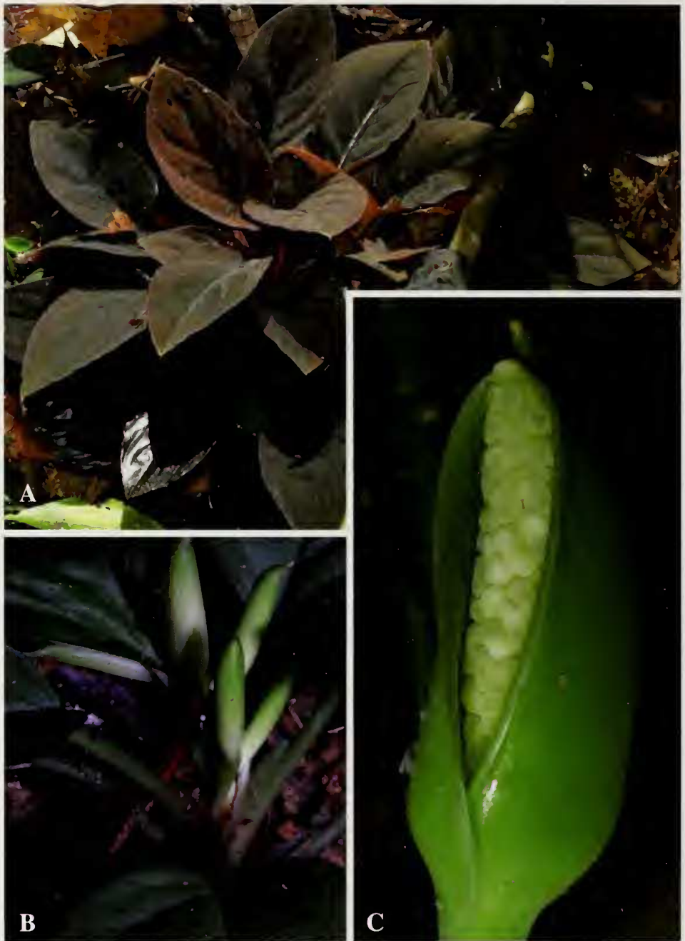
Figure 6. Homalomena humilis (Jack) Hook.f. A. Flowering plant, red expression; B. Plant with inflorescences at various stages of development, the sequence running from right (youngest) to left (oldest); C. Detail of inflorescence at female anthesis; note that spadix is fertile to the tip. A photo from P.C.Boyce & Jipom ak Tisai AR-538 (SAR); B photo from P.C.Boyce et al. AR-563 (SAR), and C photo from P.C.Boyce et al. AR-2401 (SAR).