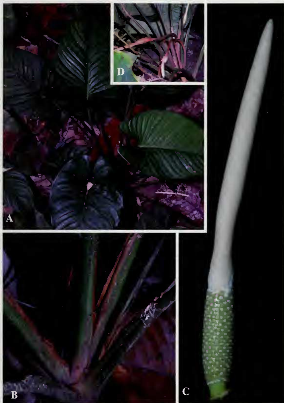
Figure 9. Homalomena sengkenyang P.C.Boyce, S.Y.Wong & Fasihuddin. A. Plant in habitat; B. Detail of petioles showing scarious petiolar sheath margins; C. Spadix, spathe artificially removed to show the diagnostic green pistils; D. Developing infructescences. All photos from P.C.Boyce et al. AR-2362 (SAR).