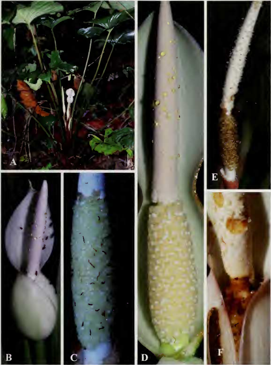
Figure 5. Homalomena hanneae P.C.Boyce, S.Y.Wong & Fasihuddin. A. Flowering plant; B. Inflorescence at early anthesis, note amber-coloured resin droplets on the spadix; C. Detail of post-anthesis female flower zone and lowermost part of the male flower zone; the black lines are fly larvae; D. Spadix at female anthesis, spathe artificially opened; note the resin droplets of the spadix and also the resin exuded from the cut spathe; E-F. Post anthesis spadix showing extensive beetle damage. All photos from P.C.Boyce et al. AR-2360 (SAR).