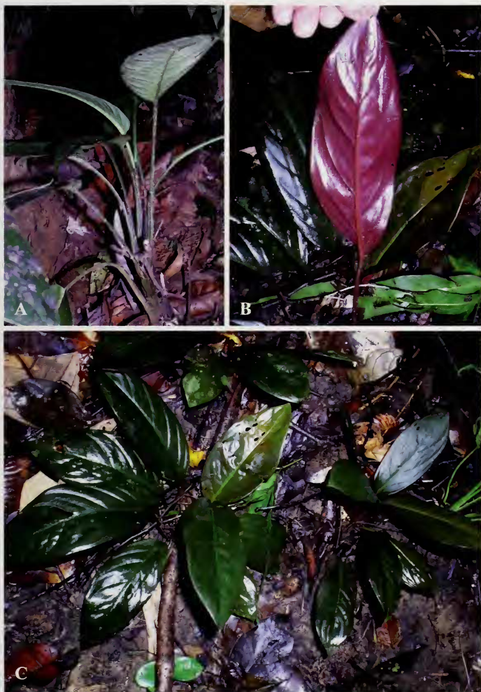
Figure 13. Homalomena sp. A & B. A. Plant of H. sp. A in habitat, note the pronounced abaxial venation and somewhat ascending stem; B-C. Plants of H. sp. B in habitat. A photo from P.C.Boyce et al. AR-2414 (SAR); B & C from P.C.Boyce et al. AR-2407