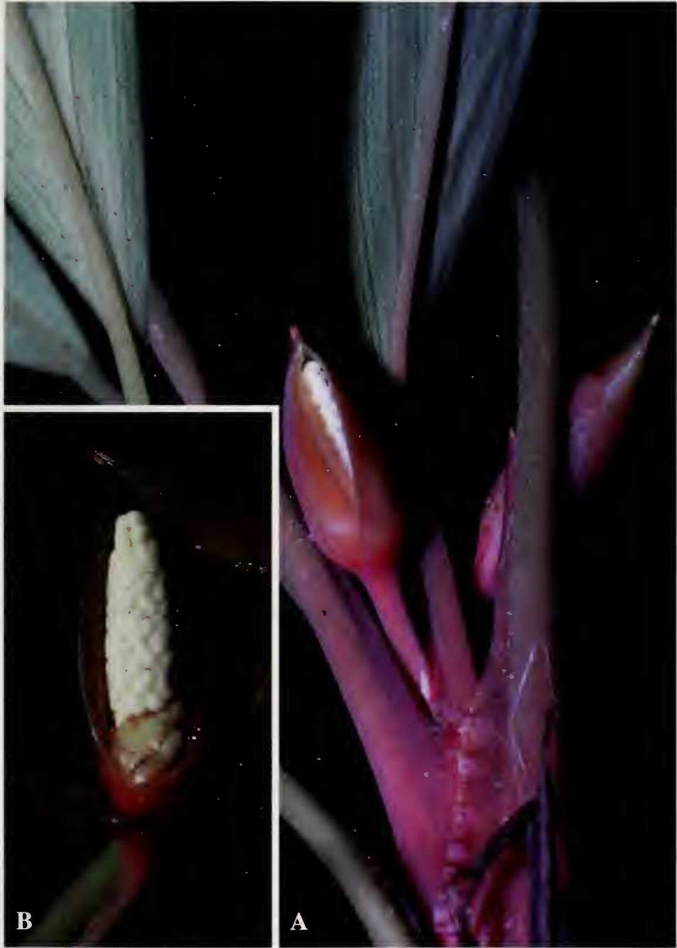
Figure 1. Homalomena atrox P.C.Boyce, S.Y.Wong & Fasihuddin. A. Flowering shoot, note the scintillating quality of the petioles and abaxial surface of the lamina; B. Inflorescence at female anthesis with spathe partially artificially removed. All photos from P.C.Boyce et al. AR-2375 (SAR).