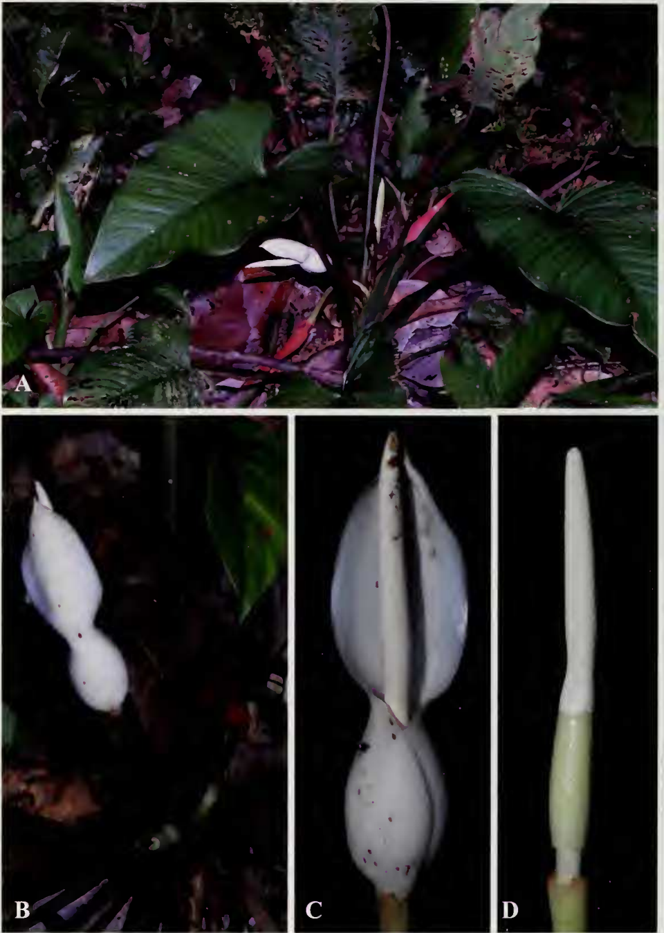
Figure 12. Homalomena vivens P.C.Boyce, S.Y.Wong & Fasihuddin. A. Flowering plant in habitat; B-C. Inflorescence at male anthesis; C. Spadix, spathe artificially removed, note the female flower zone lacks interpistillar staminodes. All photos from P.C.Boyce et al. AR-2402 (SAR).